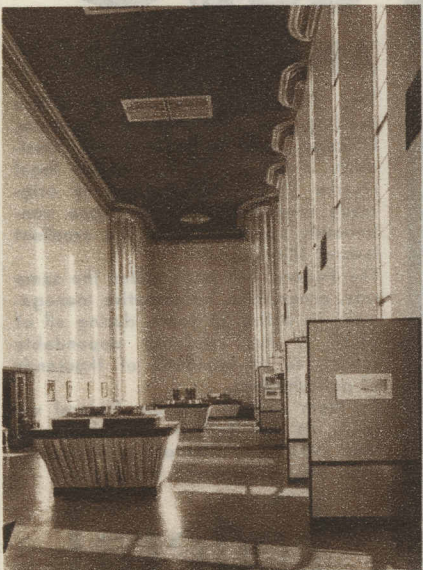
A CORNER of A Century of Progress Administration building.