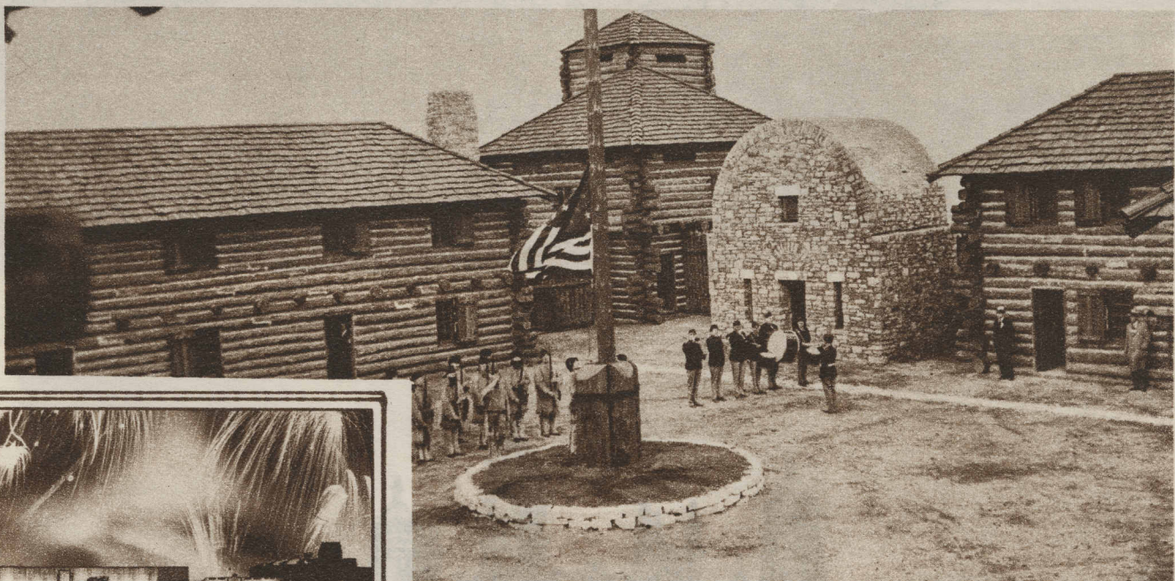
FORT DEARBORN IN THREE GUISES—At the top of the page is a drawing of the original Fort Dearborn, erected in 1803, below it is a sketch showing the fort as rebuilt in 1816, while just above this caption is an interior view of the replica of the fort on the World's Fair grounds.