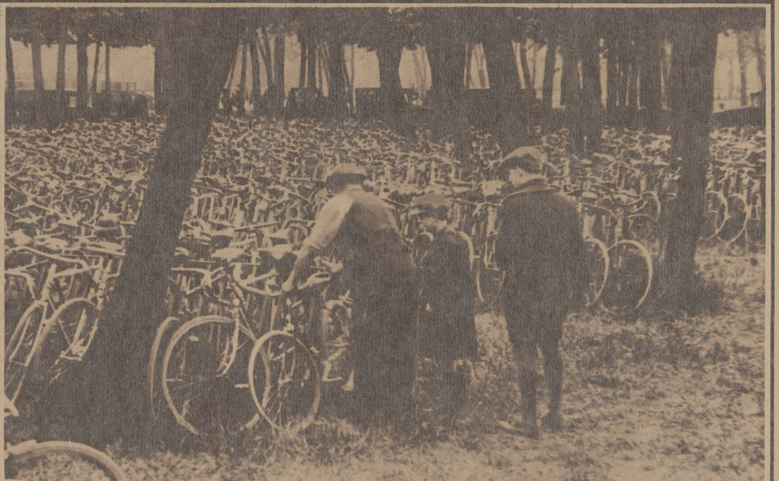
PARIS SOLVES A PARKING PROBLEM by providing this municipal bicycle garage at Vincennes, a suburb, for its thousands of pedal pushers. Just an ordinarily busy night provided the great array of bikes you see here.