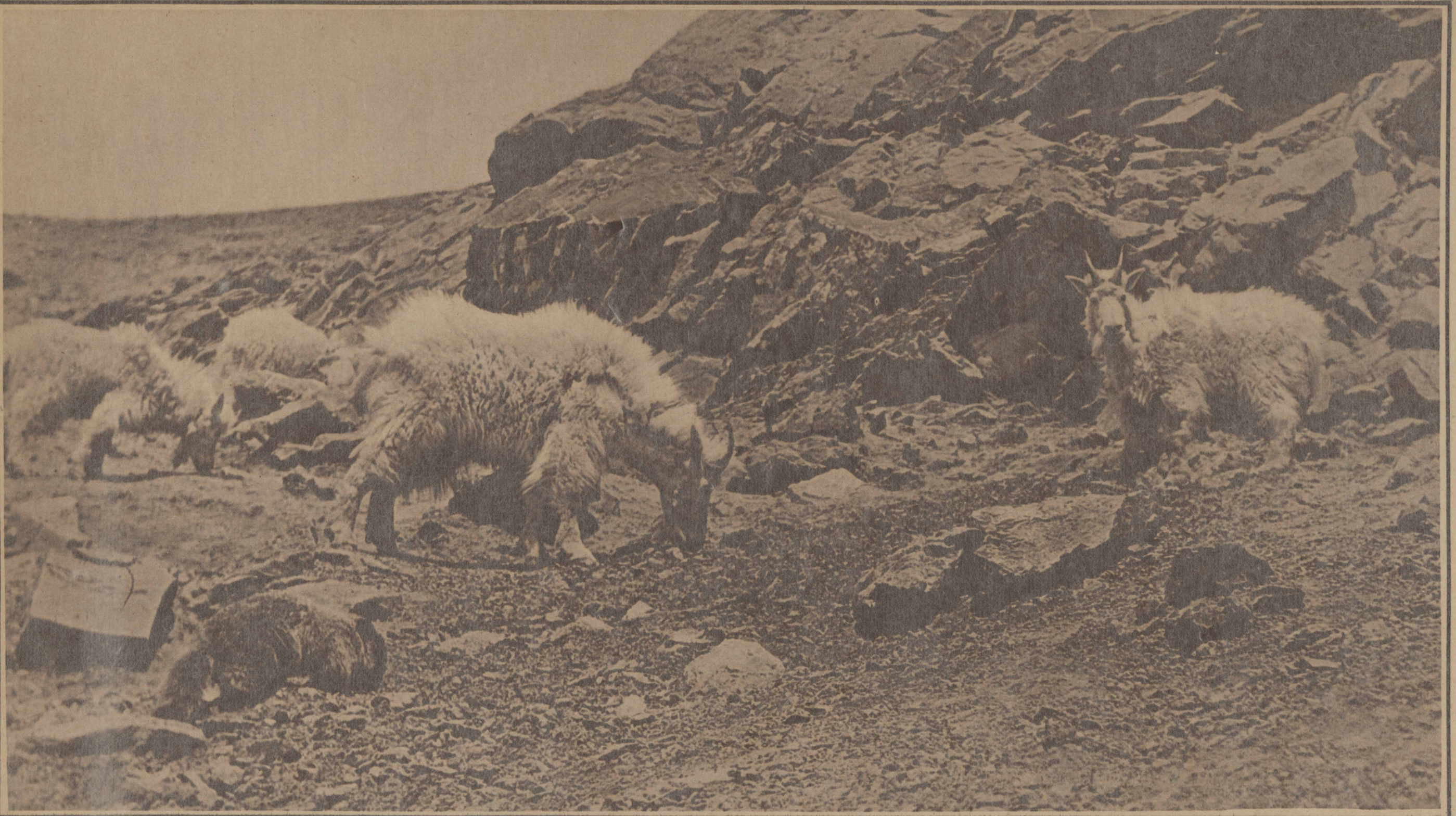
IT TOOK TWO AND A HALF YEARS TO GET THIS PICTURE, says our veracious correspondent. The horned chaps are wild mountain goats at their favorite salt lick in Glacier National park. The little feller at the left is a hairy marmot, or whistler. These animals fly at the approach of man, but a lonely telegrapher fooled 'em. He hooked up an alarm clock to operate a camera, and after many tedious experiments the timed camera finally caught this dandy photo.