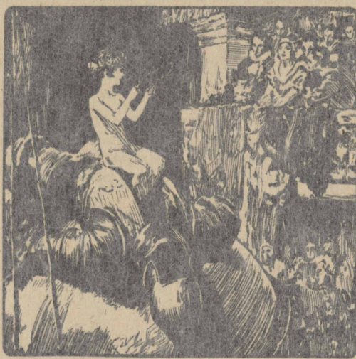
The boy in the picture was gilded to represent the Age of Gold for a 15th Century pageant in which he was to triumph over the age of Iron, represented by the mailed figure. At the end of the pageant, the child died as a result of clogged pores.

That is because its ingredients (so pure you can see through them) dissolve perfectly in water and enter and cleanse the tini-