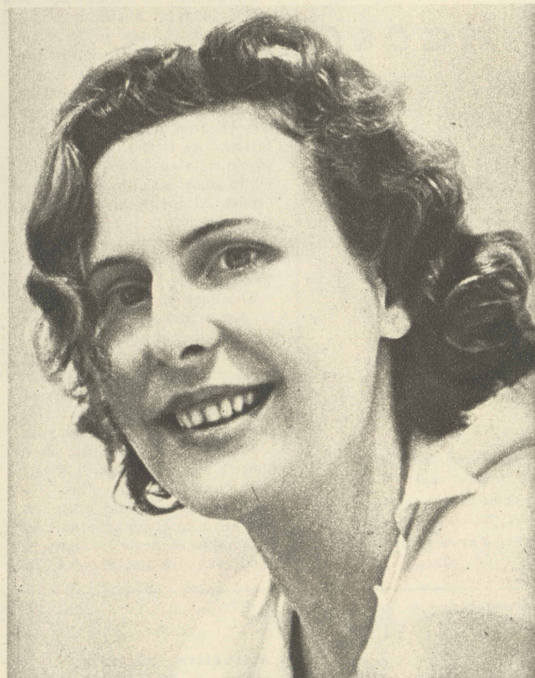
Another victory smile. Leni Riefenstahl, actress, director, and friend of Adolf Hitler, is awarded 1938 prize of Reich culture association for producing the Nazi Olympic movie.