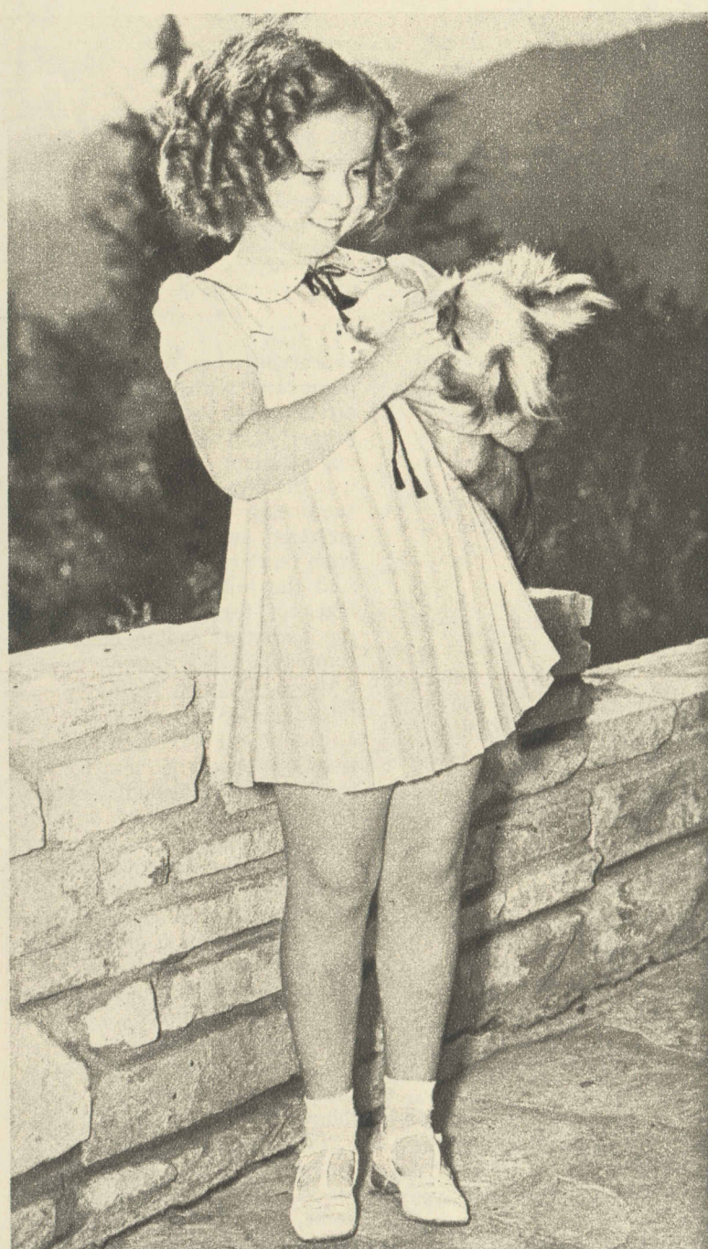
Victory smile. Shirley Temple has just won a fight to make her studio pay her dog, Ching Ching, $5 a day for appearing in her picture. The money will go to charity.