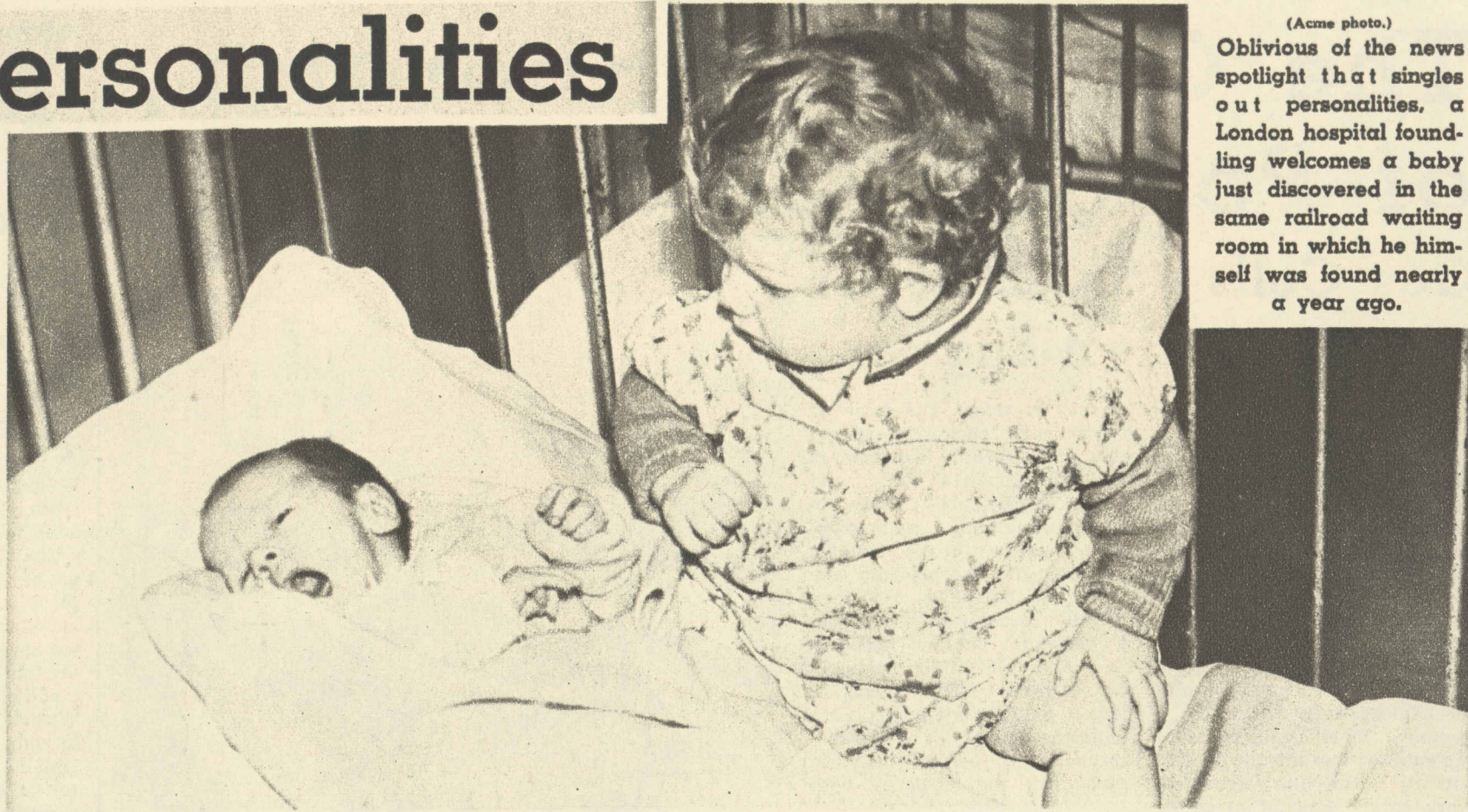
Oblivious of the news spotlight that singles out personalities, a London hospital founding welcomes a baby just discovered in the same railroad waiting room in which he himself was found nearly a year ago.