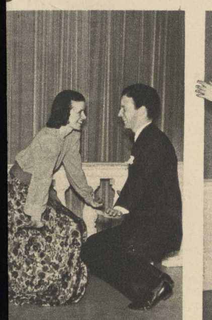
5 "NEATH . . ."