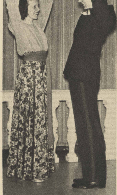
8 "NUT . . ."