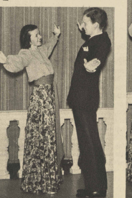
6 "THE SPREADING . . ."