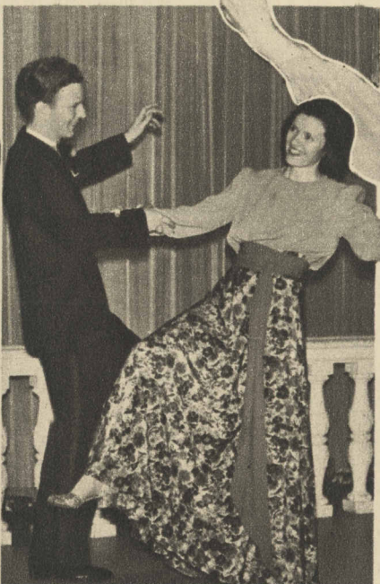
2 "There she used to sit upon my knee . . ."