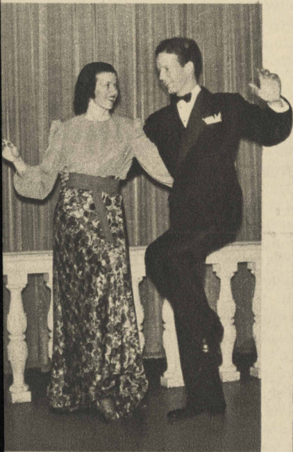
1 "Underneath the spreading chestnut tree . . ."