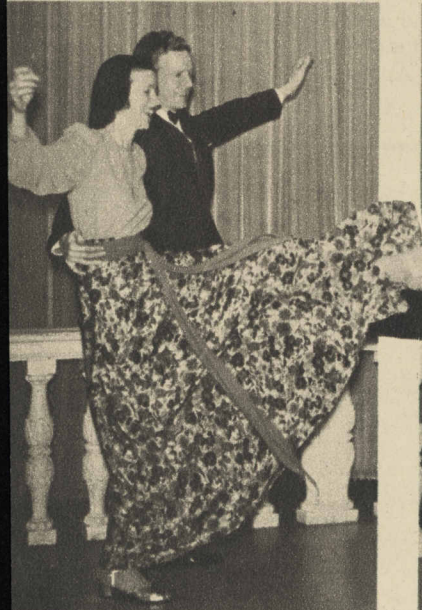
3 "I said, 'I love you . . .'"