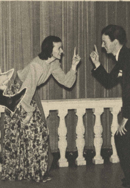
4 "Now you ought to see . . ."