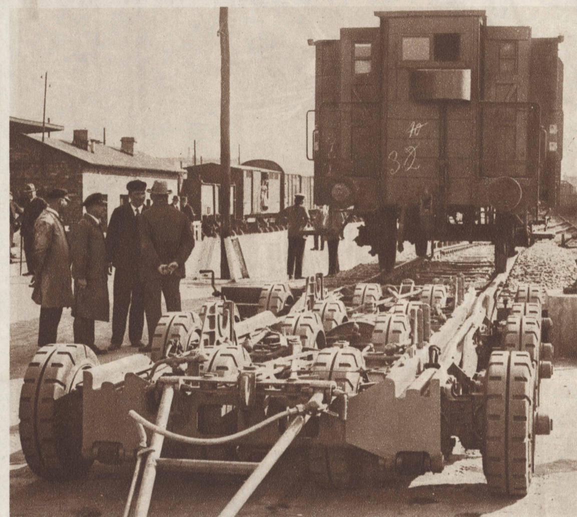
TO MOVE FREIGHT CARS to destinations distant from the railroad right of way, a German railway employee invented this device. The car is hoisted to the top of this transportable under-carriage and hauled away.