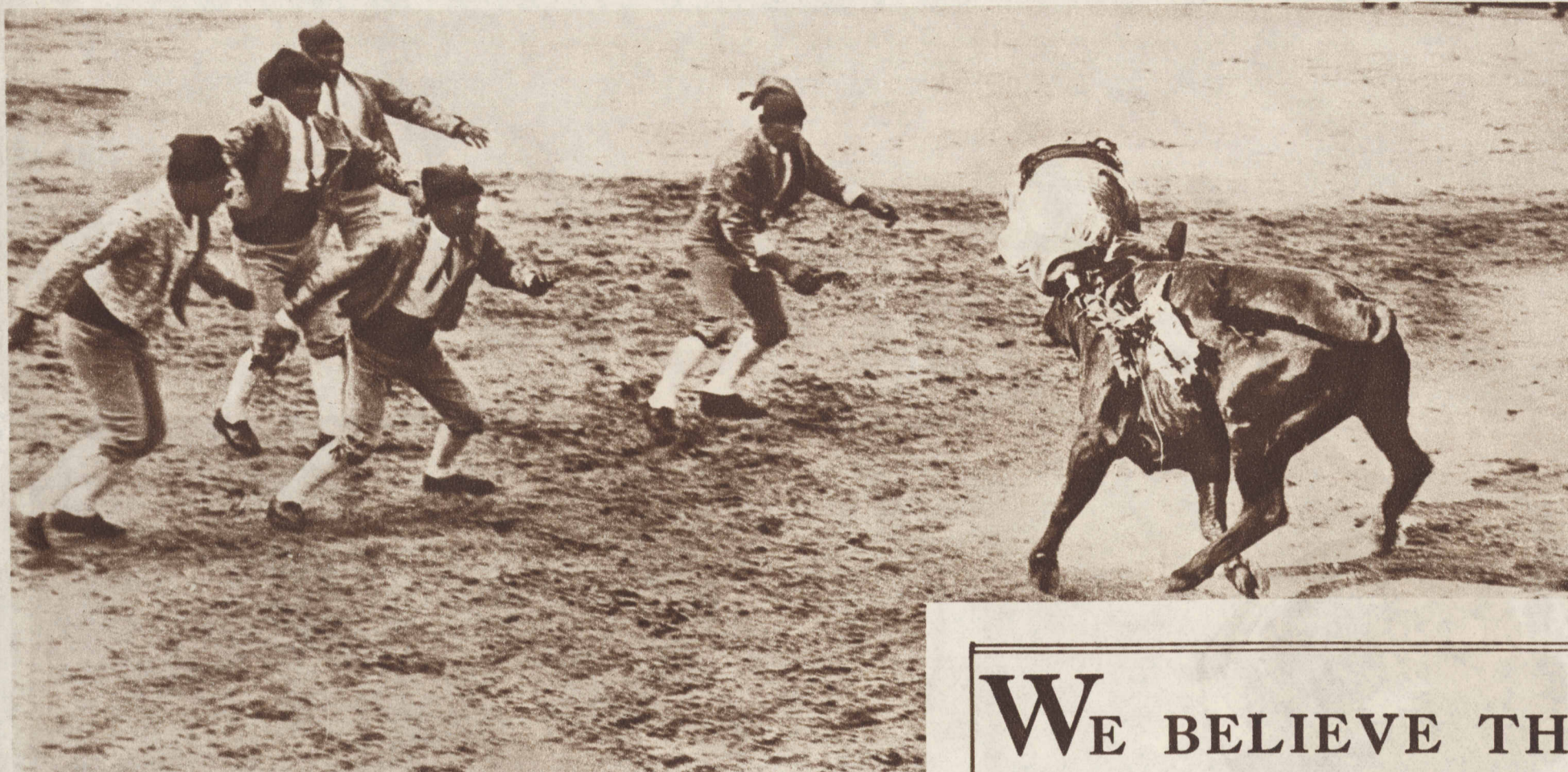
THE BULL WON this round during a corrida in Portugal.