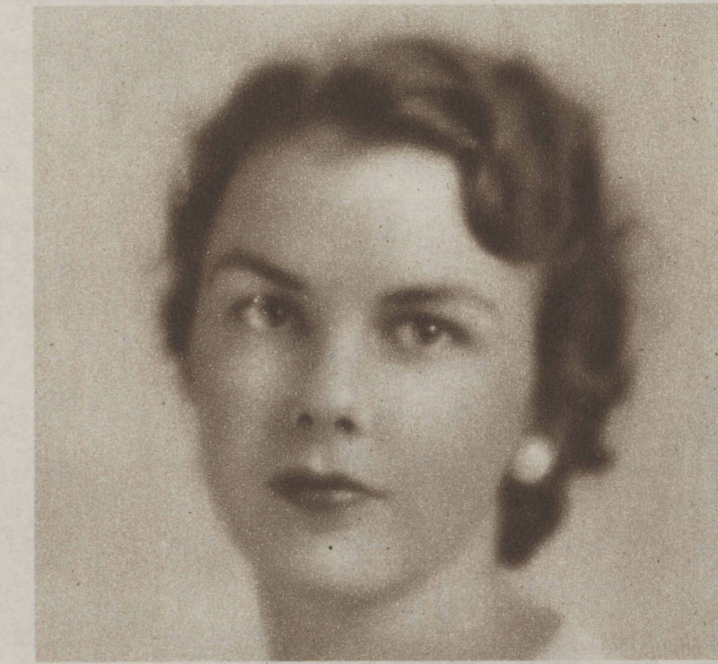
An Arkansas Beauty—Newport