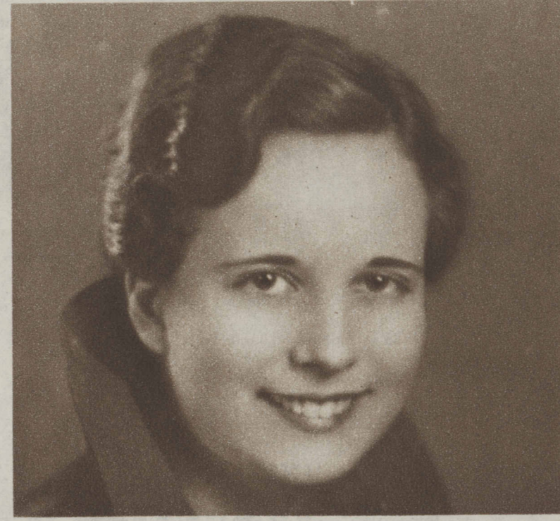
M. L. T. An Illinois Beauty—Villa Park