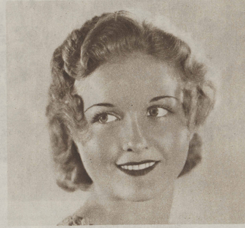
I. P. A Kansas Beauty—Kansas City