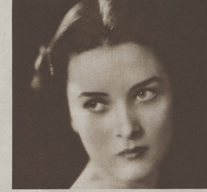
L. N. An Illinois Beauty—Evanston

FOR FULL PAGE PORTRAIT OF THE "QUEEN" OF A CENTURY OF PROGRESS SEE THE PICTURE SECTION OF NEXT SUNDAY'S TRIBUNE