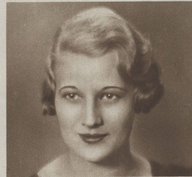
L. A. A Wisconsin Beauty—Racine