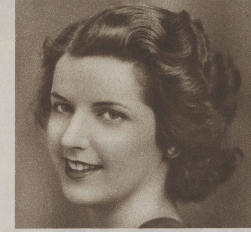
A Michigan Beauty—Marcellus