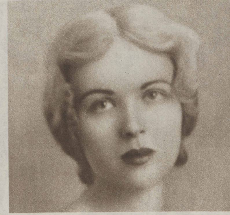
An Oregon Beauty—Portland