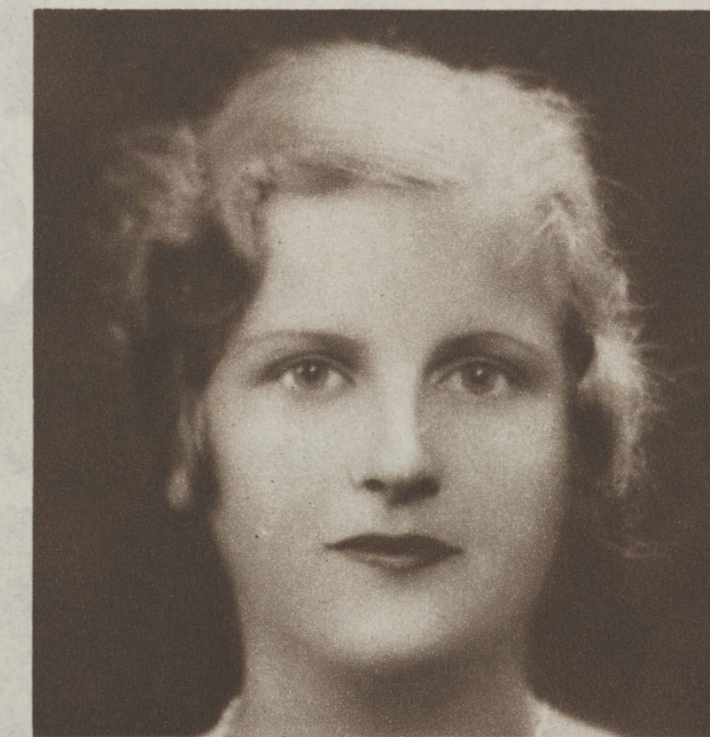
A. L. A Pennsylvania Beauty—Bethlehem

A full page portrait of the "Queen" chosen by the judges will appear in this section next Sunday.