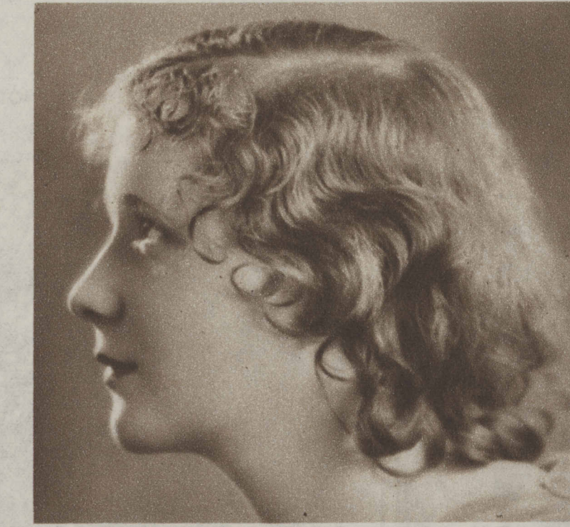
A Wisconsin Beauty—Madison