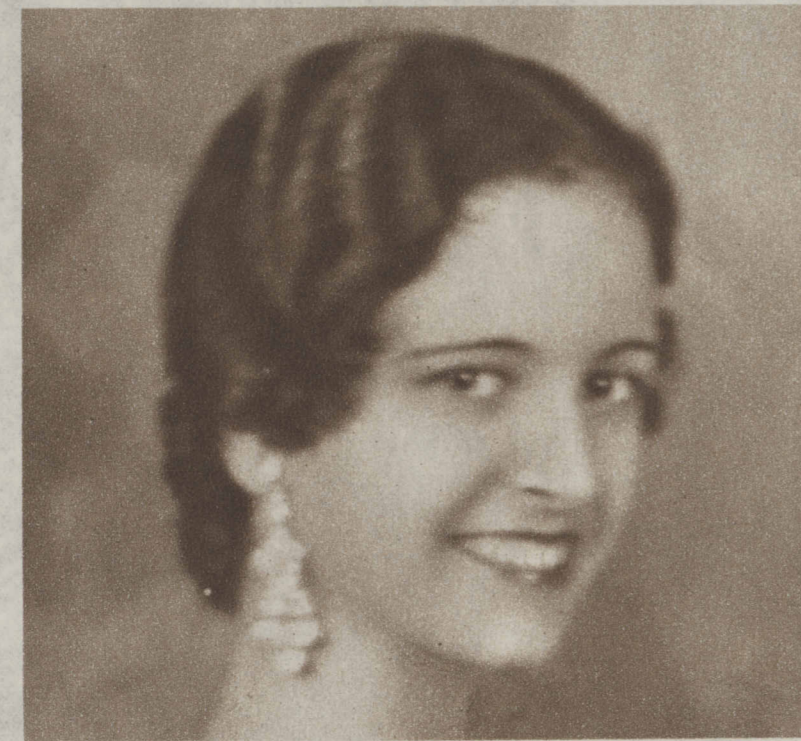
An Iowa Beauty—Waterloo