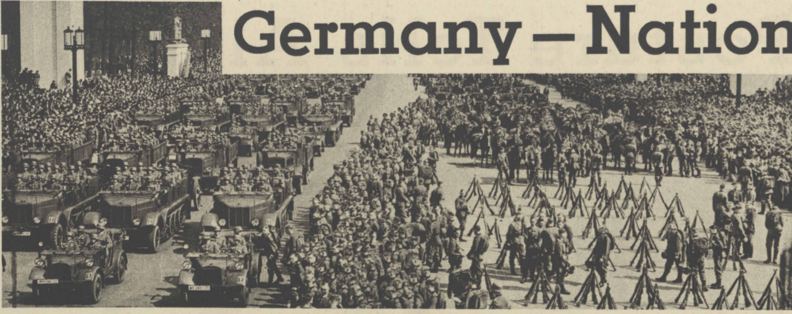
Part of the 50,000 German troops in parade on Hitler's birthday.