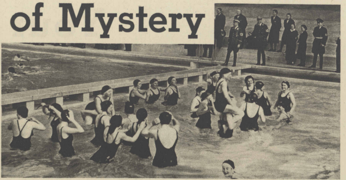
Foreign officials visit the swimming pool in Berlin's great sports hall.