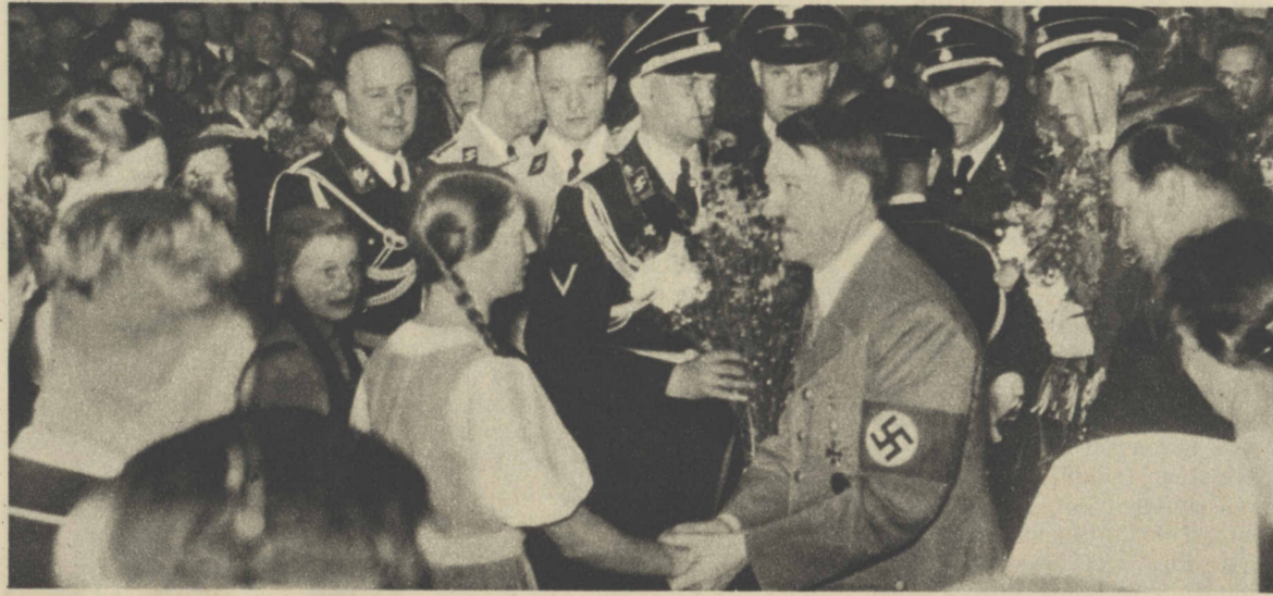
"Hitler does not live in a palace, but in the hearts of all Germans.".. The Fuehrer receives birthday greetings from German peasants.

Curiosity persuaded me to go to a vaudeville show where middle-class folk gather for entertainment and where there are no foreigners. The final act was followed by a news reel which