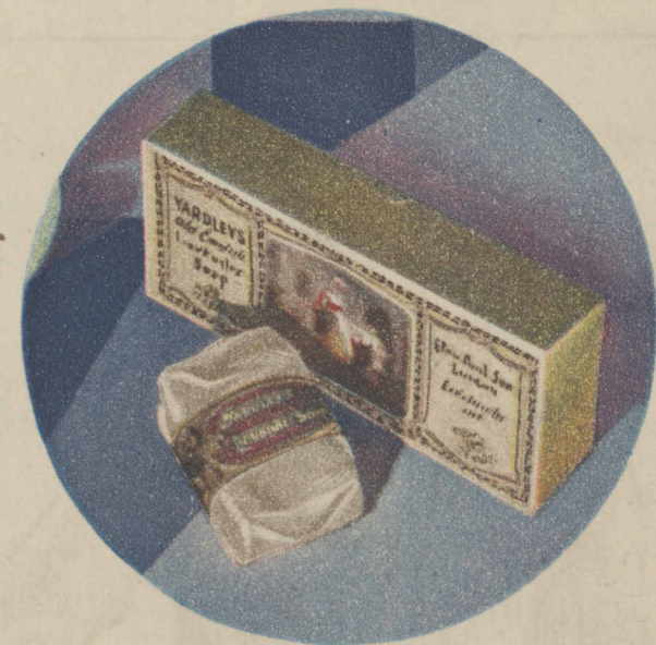
Yardley's English Lavender Soap for bath and complexion. Bland, cooling, cleansing, refreshing. Box of 3 cakes, $1, or 35c a cake. Guest size, 20c a cake. Bath size, 50c a cake.