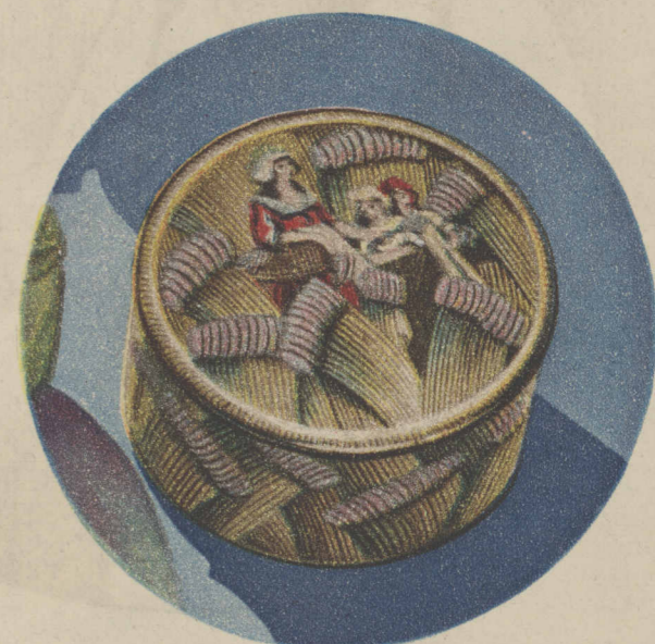
Yardley's English Lavender Face Powder in four skilfully blended shades to accentuate the charm of your own coloring. The price is $1.