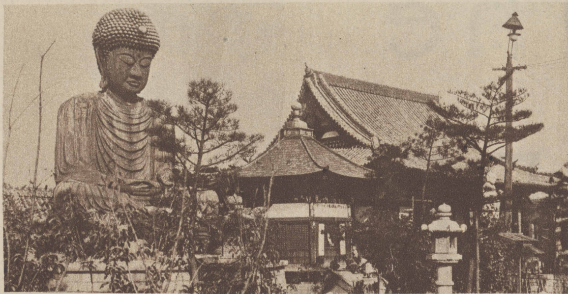
VISUALIZING INTERESTING LETTERS—The giant Nofuku-ji shrine at Kobe, Japan, whence came today's prize winner in The Tribune's competition for letters from faraway places. The shrine is one of Kobe's attractions for tourists.