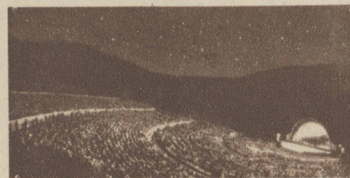
"Symphonies under the stars"

Breezes from 6000 miles of ocean keep this vacation land COOL! Nights call for light wraps . . . sleep under blankets! This can be your one biggest vacation year. Plan now, MAIL THE COUPON!