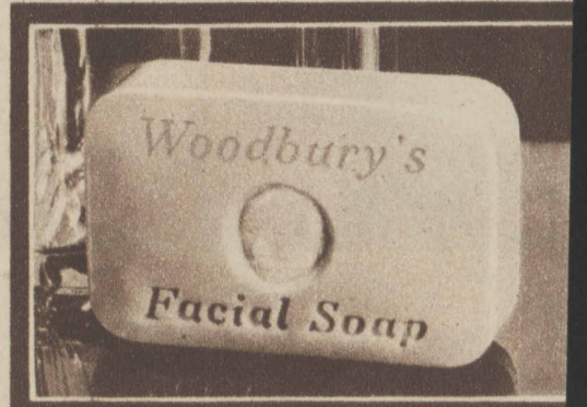
See what a special soap made to aid the skin's natural processes will do for you. Give your skin its first Woodbury treatment today

Woodbury's is 25 cents a cake at any drug-store or toilet-goods counter. It also comes in convenient 3-cake boxes. To meet the Woodbury laboratories'