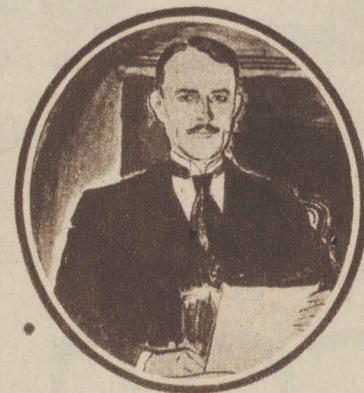
Years of scientific study are behind the Woodbury prescription for the care of the skin

In 7x11 folders One large etching free Four proofs to select from MORRISON 64 West Randolph St. Telephone CENTRAL 2719 OPEN SUNDAYS 10 TO 4