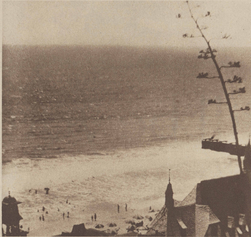
A beach along the friendly Pacific . . . (28 equally interesting photographs in free ITINERARY offered below)

FROM most points in the United States it is possible to spend eleven days of a two-weeks vacation in Southern California. And costs while here need not exceed $70 . . . or $6.35 a day . . . including sightseeing!