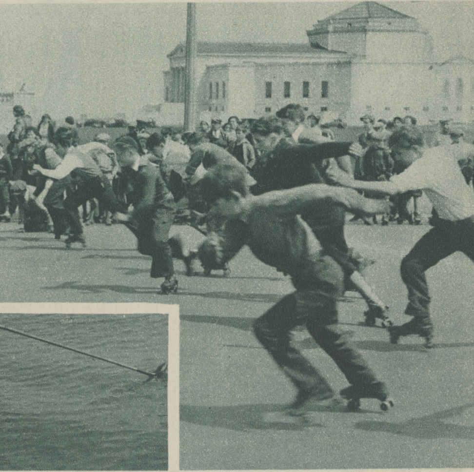
THE ROLLER SKATE comes into its own as school children race in Grant park. In the background, the Shedd aquarium.