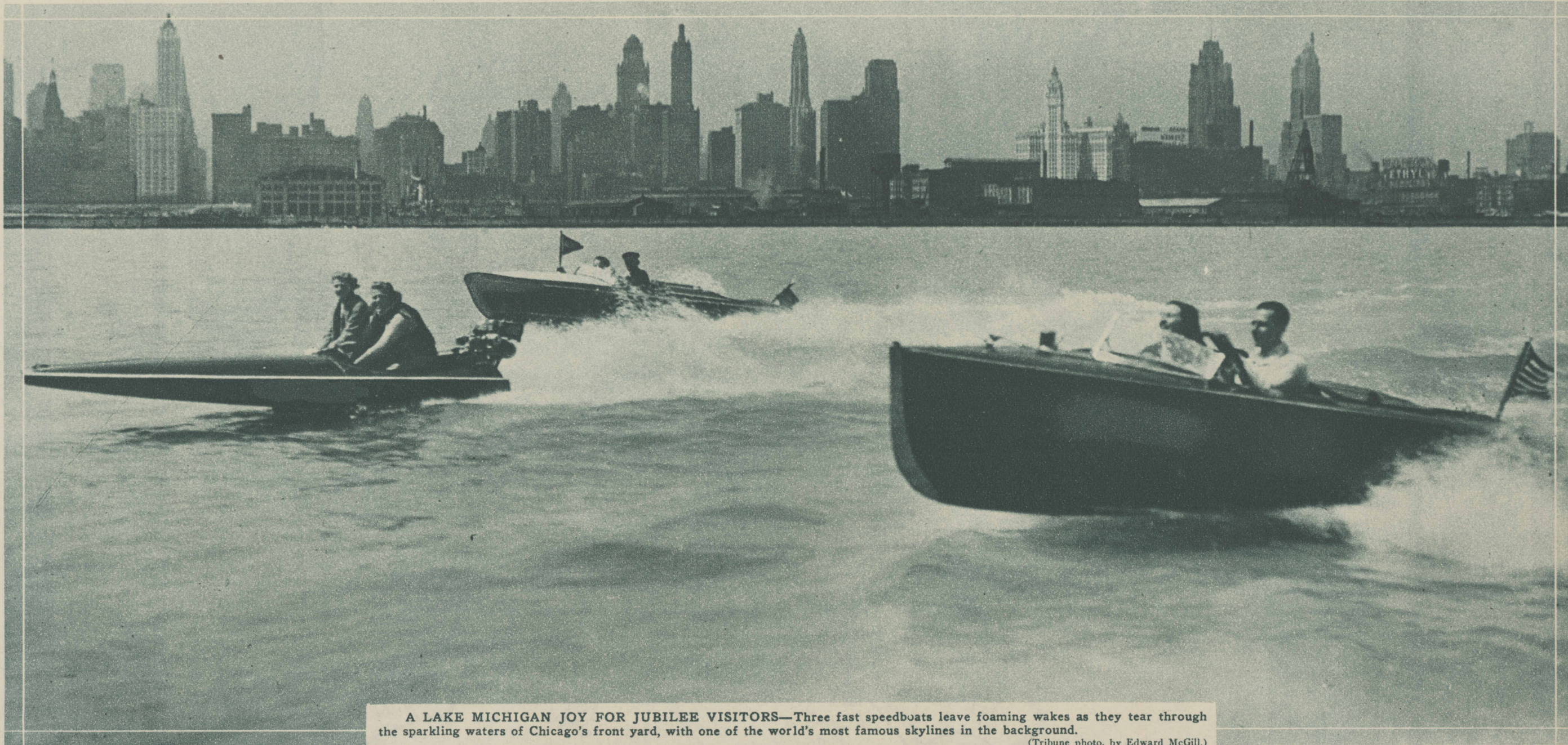
A LAKE MICHIGAN JOY FOR JUBILEE VISITORS—Three fast speedboats leave foaming wakes as they tear through the sparkling waters of Chicago's front yard, with one of the world's most famous skylines in the background.