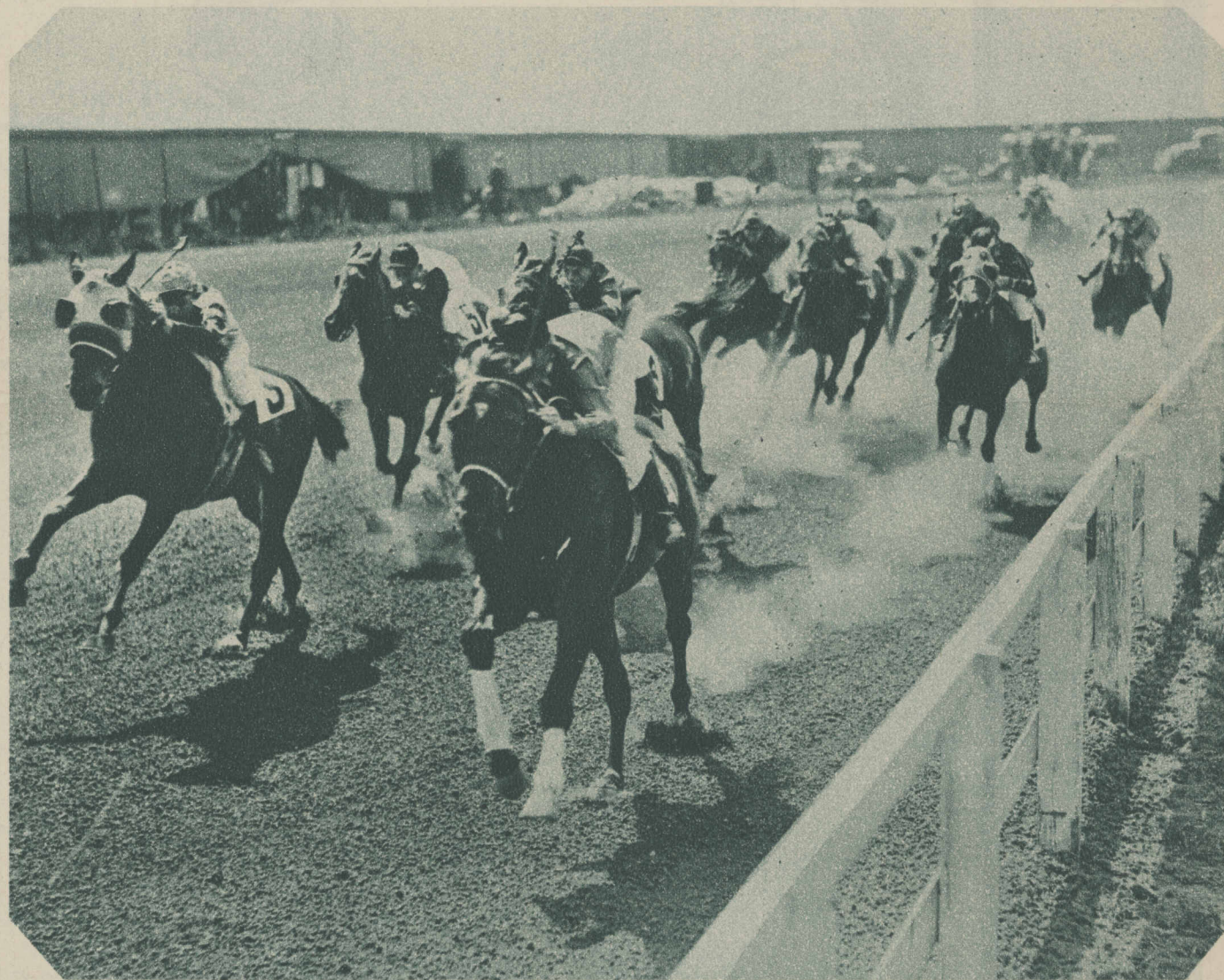
AN AFTERNOON AT THE RACES—Chicago turf fans take a half-holiday off these fine spring days, take a train to Aurora to see the horses run, and, perhaps, make trifling investments in improvement of thoroughbred breed. At the left, a typical crowd of spectators at the Aurora track, where Chicago's spring and summer season of racing was inaugurated. At the right, the talented hoofs of a fast field flash down the home stretch in a thrilling finish.