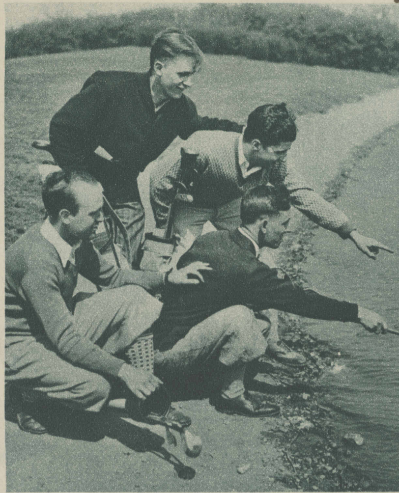
THE VISITING GOLFER could fight it out along this line all summer, playing one course a day, without exhausting Chicagoland's array of splendid courses. This foursome attempts to retrieve a ball that dived to the bottom of a water hazard in Marquette park.