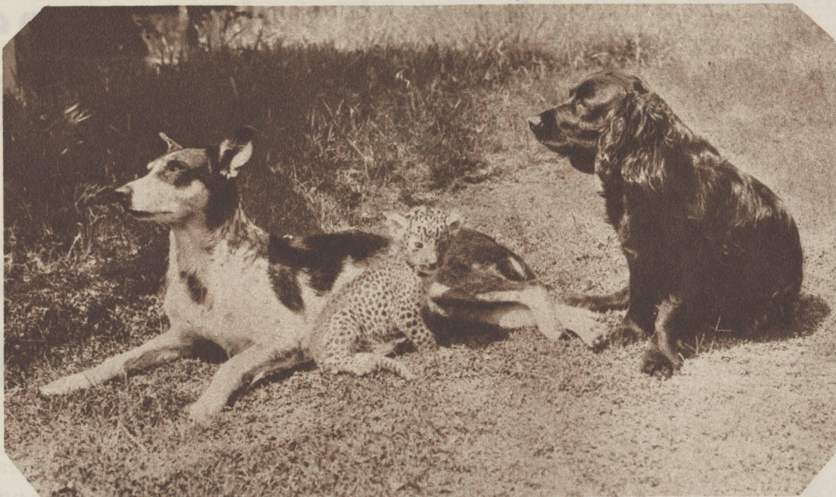
THIS LEOPARD CHANGED, not its spots, but its mothers, and twice at that. Olga was deserted by her mother in a Los Angeles zoo. She was turned over to Betty, the spaniel at the right, but Betty failed in her duties as mother, and so the orphan was transferred to Sally, at the left. Even now she doesn't look very happy about it.