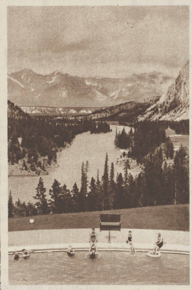
HERE, BOW RIVER VALLEY makes a gorgeous backdrop to Banff Springs Hotel's aquatic attractions. Warm sulphur and cool glacial swimming pools.