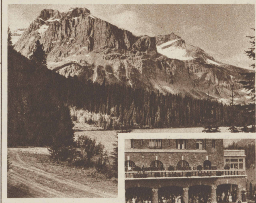
GREEN AND DEEP!—A sparkling jewel, as its name implies, Emerald Lake is backed by snow capped mountains. Emerald Lake Chalet, nearby, is an easy motor ride from Banff or Lake Louise.