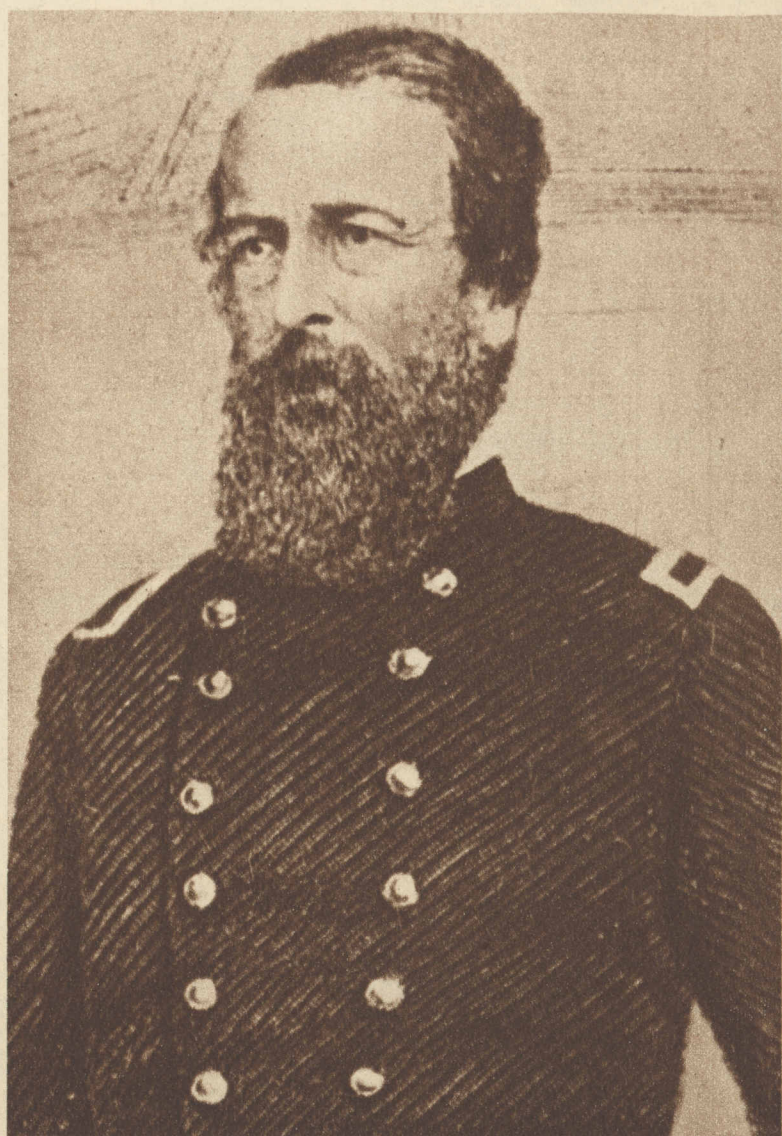
WITH GRANT AND VICKSBURG history inevitably associates the name of Admiral David Dixon Porter, whose assistance in the reduction of the beleaguered city was vital. Up and down the death-laden Mississippi Porter ranged during the civil war, writing his name high in the annals of that conflict and leaving to posterity an illustrious example of bravery and devotion.