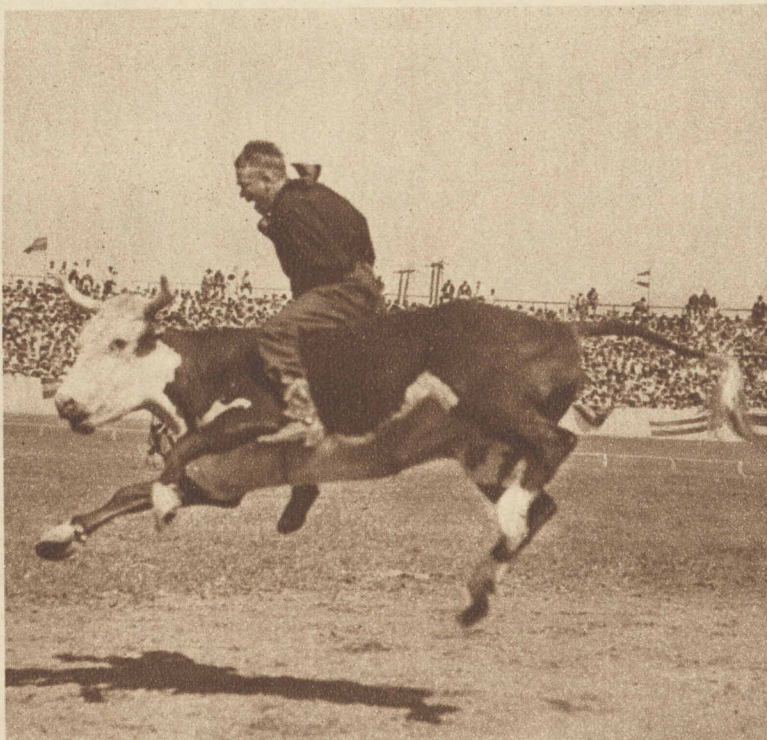
UPS AND DOWNS OF THE WILD WEST BUSINESS—The Baker ranch rodeo diverts a crowd reported at 50,000 on a California field.