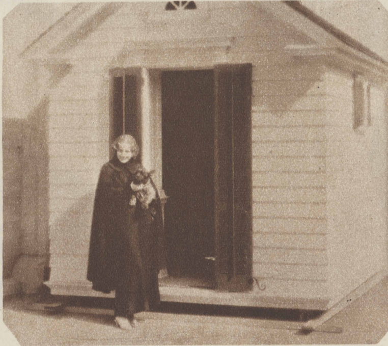
HER BUNGALOW DRESSING ROOM—It's a gift, the dressing room, to Joan Crawford from her husband, Douglas Fairbanks Jr. And so is "Woggles," her new Scotty.