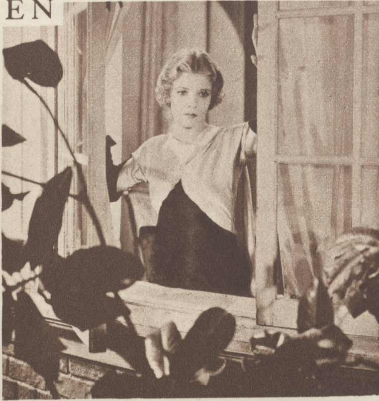
A PENNY FOR HER THOUGHTS would be an interesting bargain. The camera's subject, looking out her window so pensively, is Elissa Landi of the films.