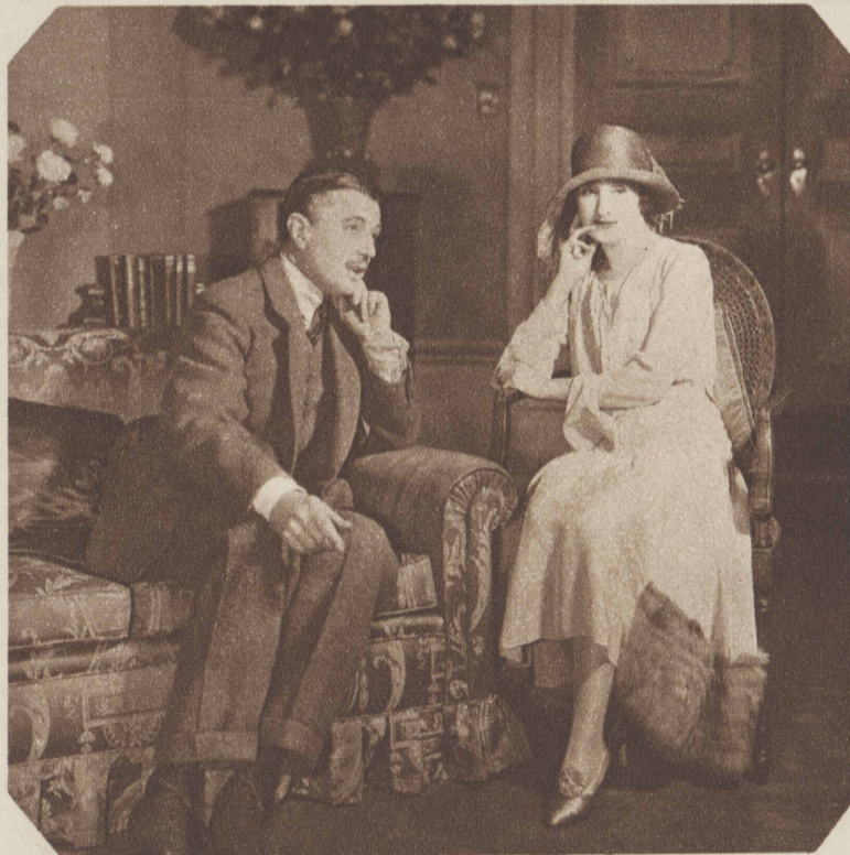
FROM A POPULAR COMEDY, this scene shows the first Mrs. Fraser telling her ex-husband how to get rid of the second Mrs. Fraser. Grace George is the clever lady and A. E. Matthews is the stupid male. Miss George brought this successful play—one of Burns Mantle's "ten best"—back to Chicago for a return engagement.