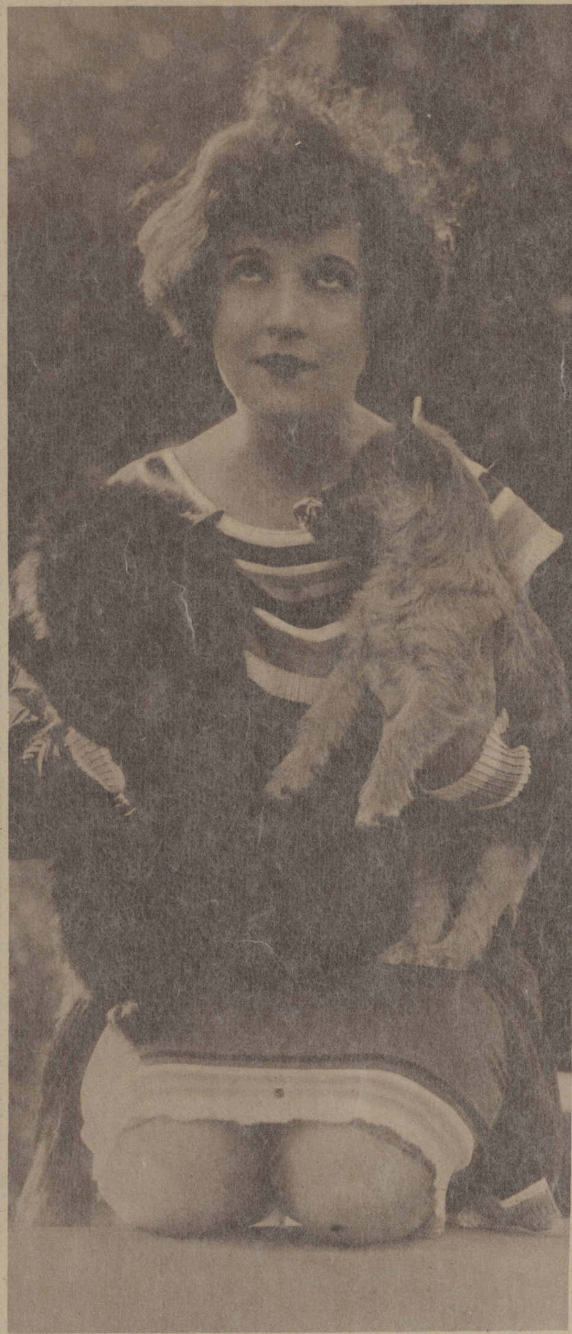
MARIE PREVOST is here discovered in Marie's garden with Marie's pets. Soon, however, you'll see her "Up in Mabel's Room." That's the name of her new starring picture.