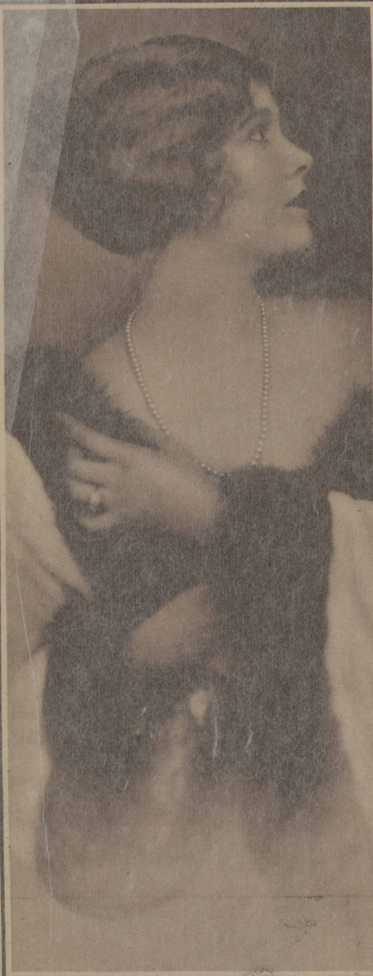
ESTHER RALSTON, Paramount's fair-haired darling, is to be starred during the coming year by that company.