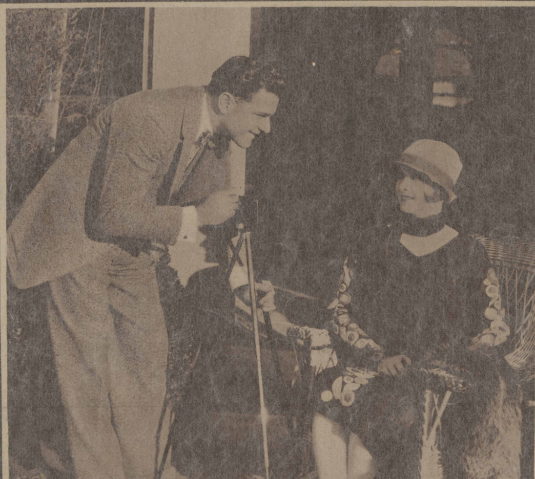
BERT LYTELL and CLAIRE WINDSOR at home! A closeup of a leading man and the leading lady of his life in their domestic haunts.