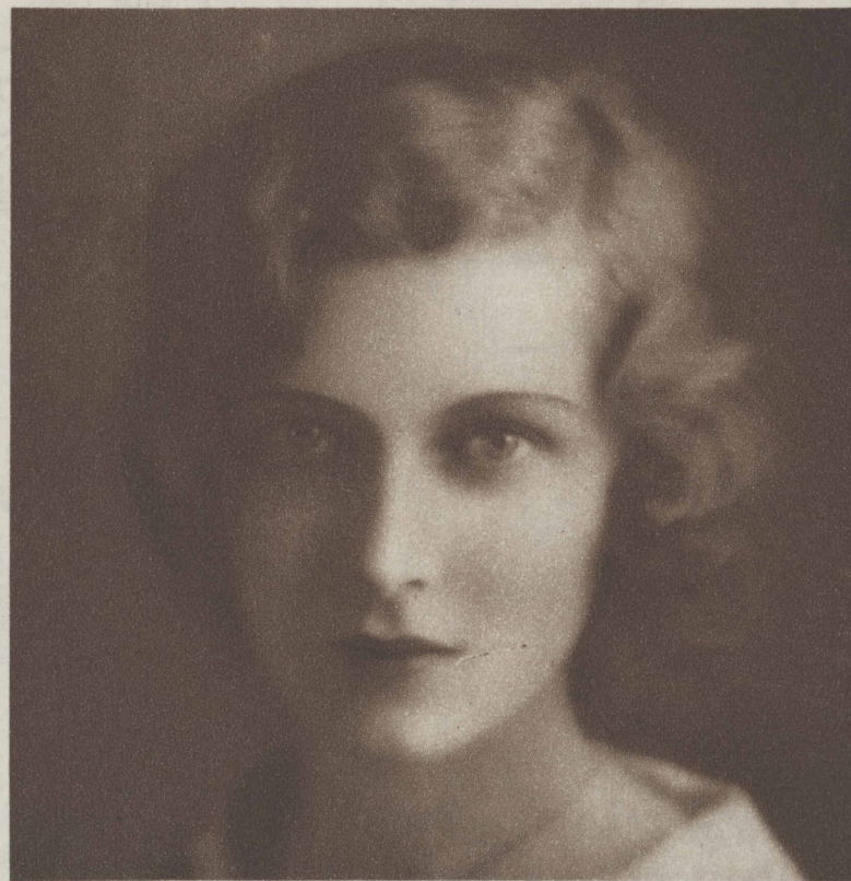
An Ohio Beauty—Akron