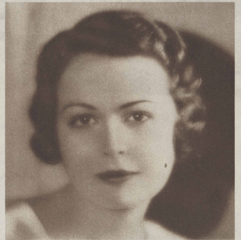
I. R. A Louisiana Beauty—New Orleans