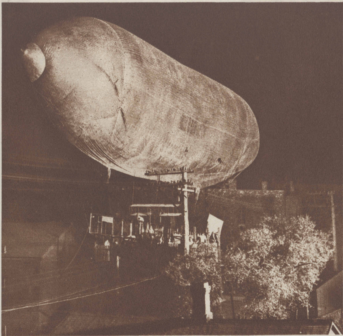
WHEN A PIONEER DIRIGIBLE CAME TO GRIEF—Capt. Horace Wild's flying bag, which was being exhibited at White City early in the century, wrecked on live wires at 39th and State sts.