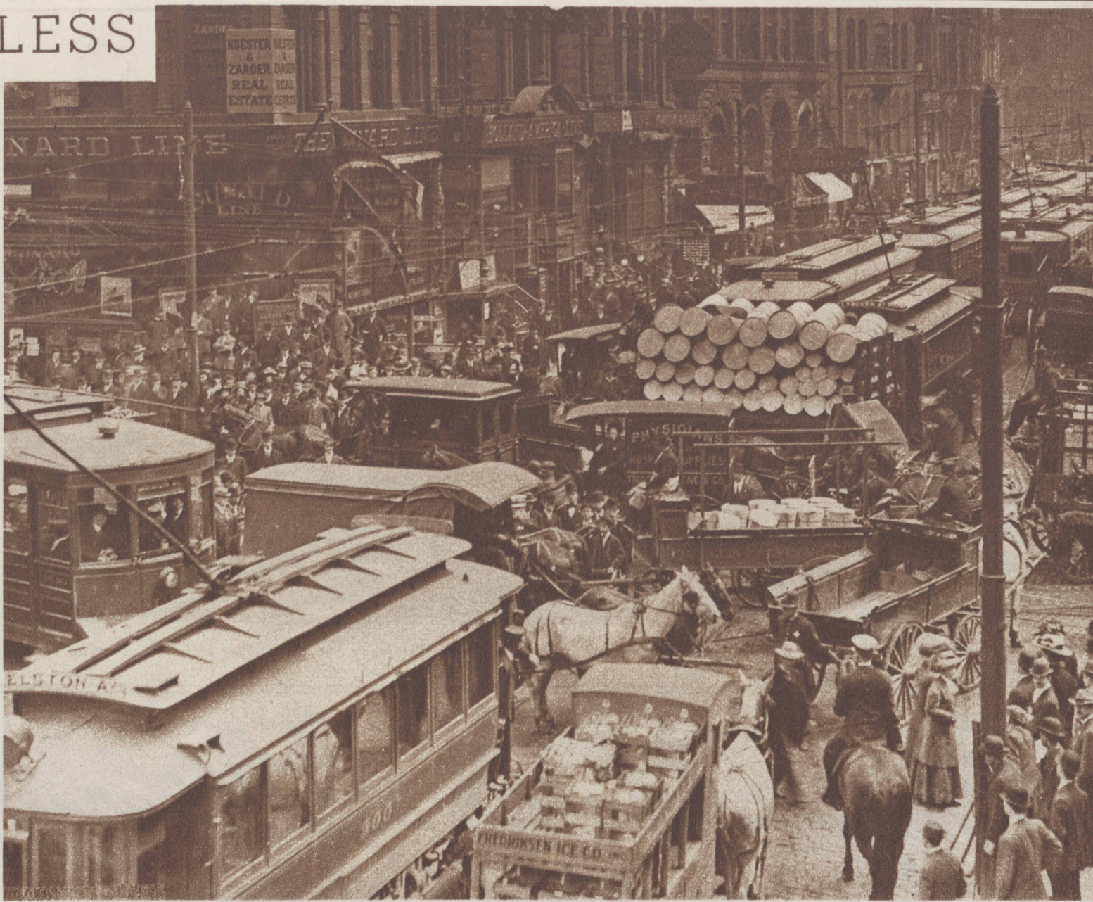
TRAFFIC TANGLE OF 1909—On May 25th of that year, this snarl of horse-drawn vehicles tied the corner of Dearborn and Randolph streets into a five-minute knot.