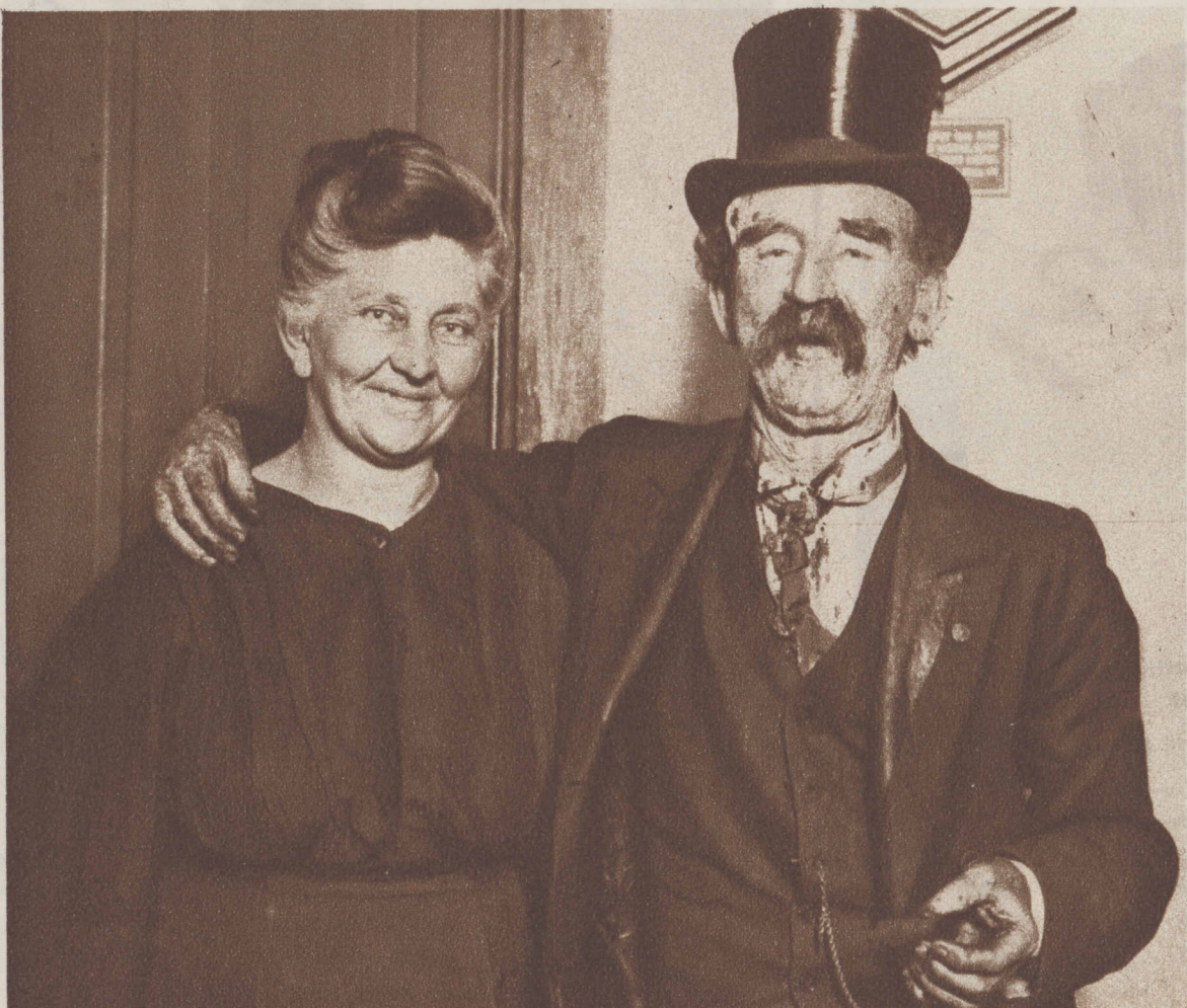
EMPEROR AND EMPRESS OF THE "DEESTRICK OF LAKE MICHIGAN"—Cap'n George Wellington and "Ma" Streeter, who claimed and fought for the rich Gold Coast area known as Streeterville, from the time in 1886 when their boat Reutan went ashore on a sandbar at the foot of Oak street. The cap'n died in 1921.