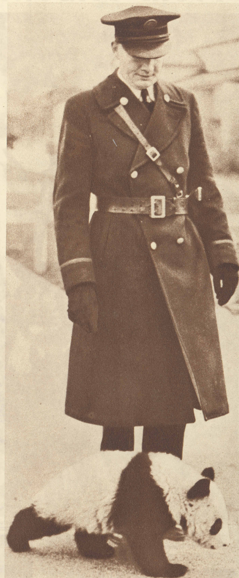
MEI-MEI, the Brookfield zoo's baby giant panda, strolls under the eye of a guard. A full page color picture of the late Su-Lin will appear on the front page of this section on May 15.