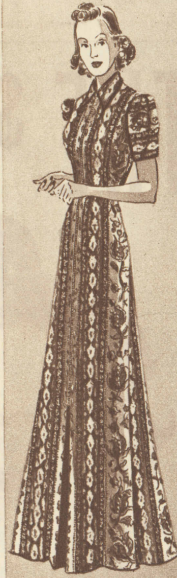
New Cotton Print $1.39 Housecoats

Silk crepes, pure dye satins, satin and bemberg rayons. Tailored, lace trimmed, evening styles; light, dark shades. Sizes 32 to 44, but not in every color or style.