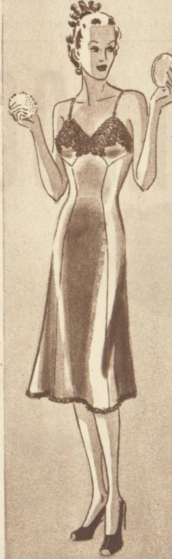
Famous Brand $1 Lovely Silk Slips

A favored fashion . . . rayon chiffon over a colorful rayon print on navy or black ground. Note the accents . . . glass buttons, flower at the neckline. Sizes 38 to 44.