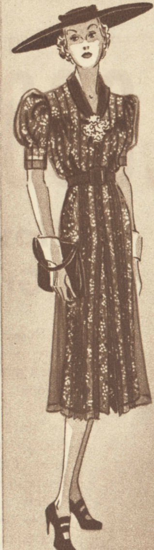
Women's Rayon $5.50 Sheer Dresses

Just step in . . . zip up and tie the belt in back! Bright flower cotton print on white ground. Tubs beautifully. Sizes 14 to 20, 38 to 44; paisley pattern in sizes 46 to 52.