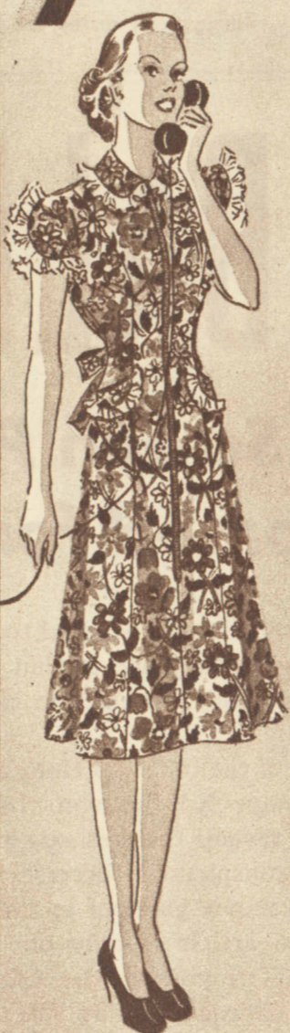
Z-Z-Zip Princess $1.65 Peggy Dresses

Just step in . . . zip up and tie the belt in back! Bright flower cotton print on white ground. Tubs beautifully. Sizes 14 to 20, 38 to 44; paisley pattern in sizes 46 to 52.