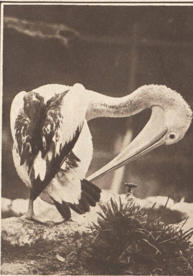
A FASTIDIOUS BIRD IS THE PELICAN —This one indulges in a last minute cleanup before breakfast in the Melbourne, Australia, zoo.