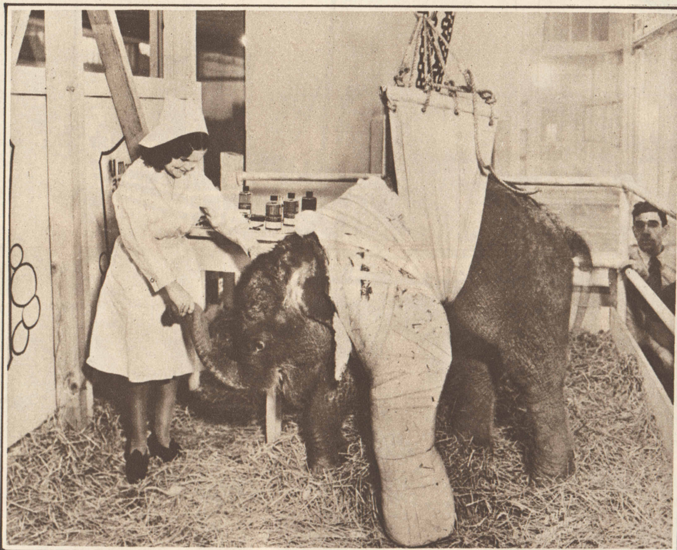
TWELVE MEN AND A BLOCK AND TACKLE were required to hold Zoobu, 350 pound baby elephant, when a broken leg necessitated the application of a plaster cast. Zoobu is one of the occupants of the animal incubators at Atlantic City, N. J.