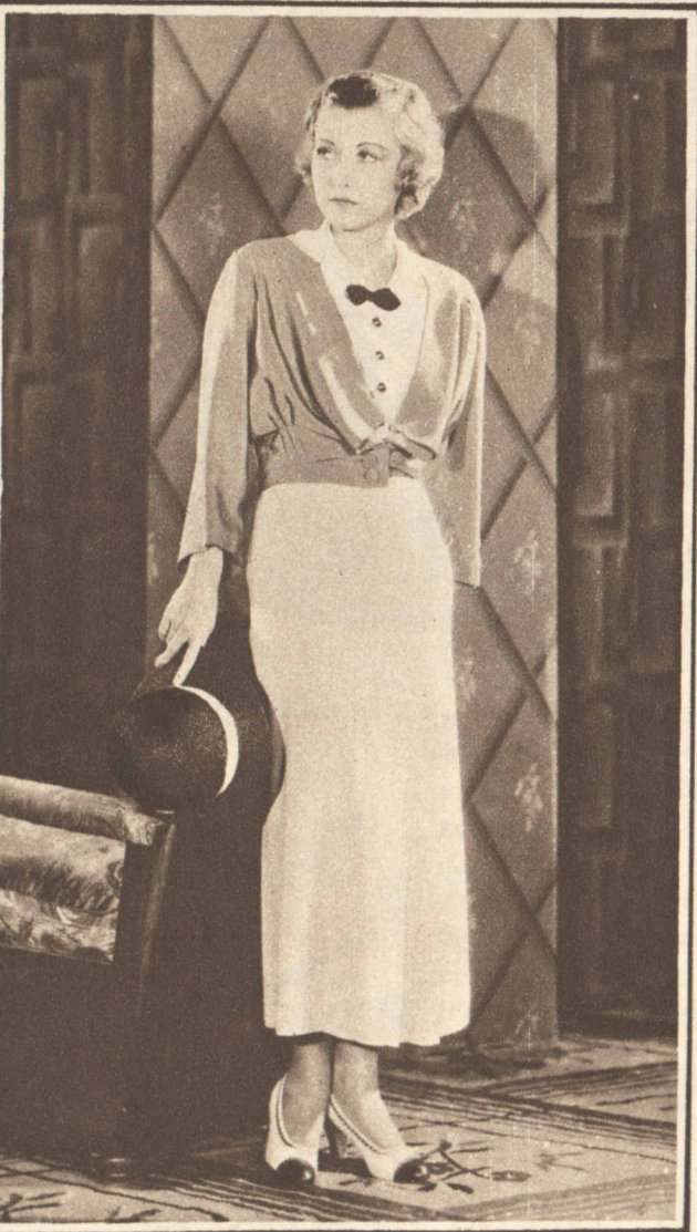
SUMMER STREET ENSEMBLE —Fashioned of suede-finished silk crepe in contrasting colors is this smart costume. The one-piece frock is white, with high collar fastened with a tailored black ribbon bow, while the high waisted jacket is bright green. A black hat of Montelupo straw and black and white pumps complete the ensemble.