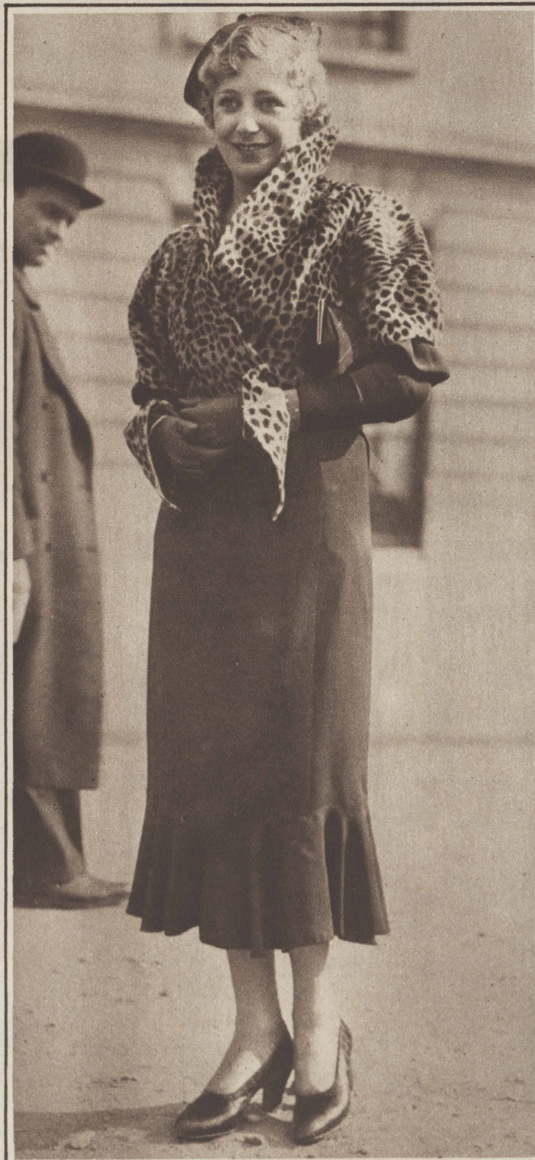
THE JACQUETTE AT AUTEUIL—A French mannequin displays this short coat of leopard skin at the French race course. The hat, fashion's latest dictum, is worn at the back of the head.