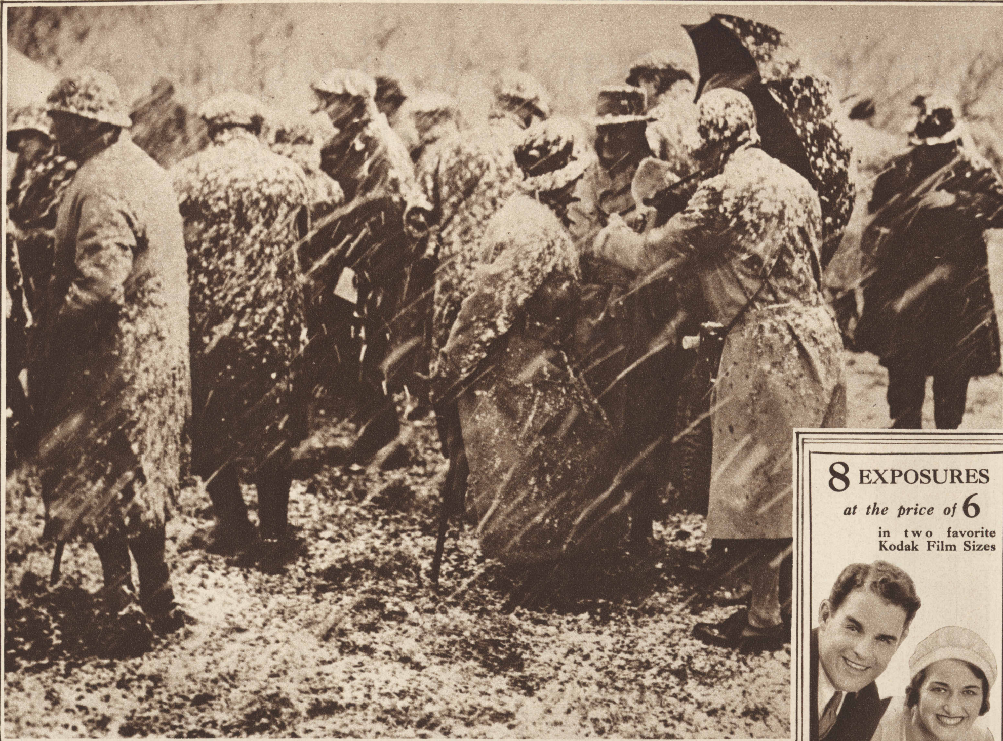
DESPITE THE WEATHER, sports lovers turn out in force in merrie England, as witness this snow covered group of spectators at the recent point-to-point meet at East Larmouth in Northumberland.

4700 Sheridan Road 2342 East 71st Street 4052 West Madison St. 1313 East 63rd Street 6440 So. Halsted St. 1136 Lake St., Oak Park 607 Davis St., Evanston South Bend Gary Rockford Elgin