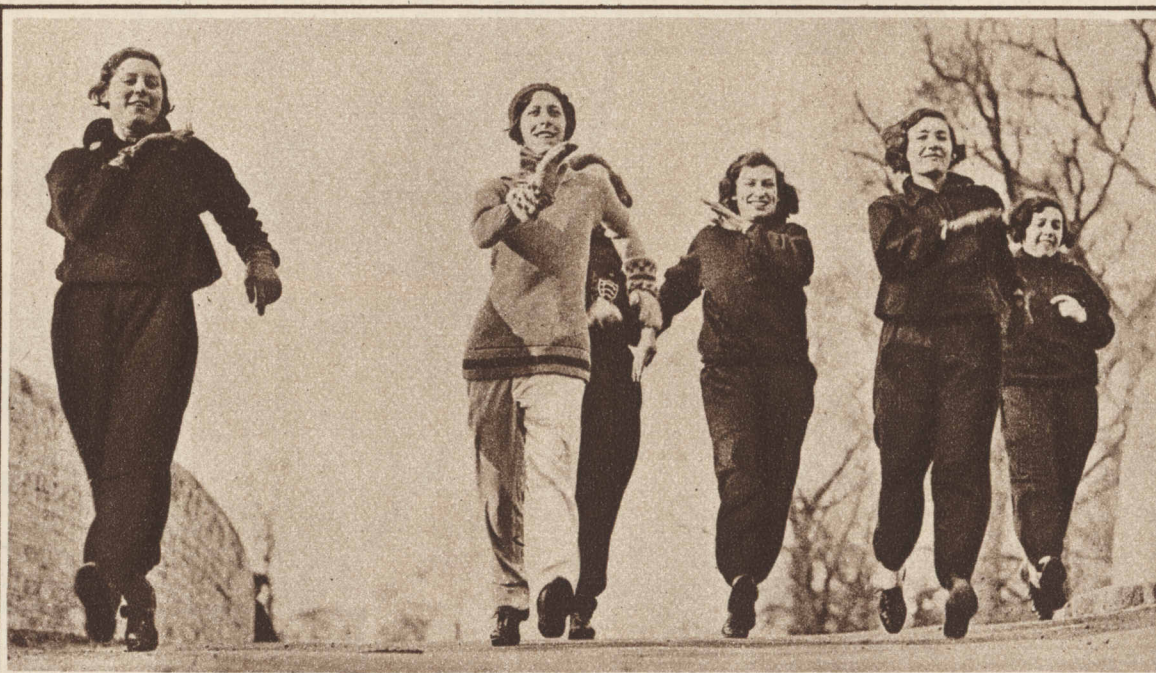
A WALKING CLUB IN ACTION—In training for a forthcoming walking race, members of the Middlesex, England, Ladies' Walking club put a great deal of variety of arm action into their exercises.

ALCOHOLIC CONTENT LESS THAN ONE-HALF OF 1 PER CENT BY VOLUME