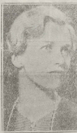
ANNA ROOSEVELT DALL