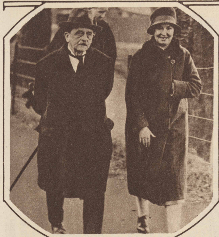
SIR JAMES BARRIE takes a stroll in his old home town, Kirriemuir, Forfarshire, Scotland, the scene of his birth. With him here is one of the characters of his novels, plainly cherishing no rancor for having been written up.