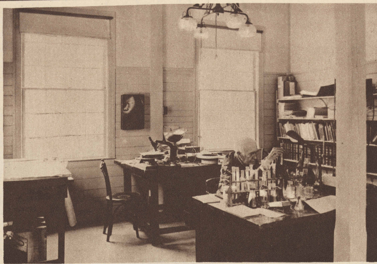
THE ELECTRICAL WIZARD, Thomas A. Edison, examines chemical specimens in the laboratory on his estate at Fort Myers, Fla., where he has been spending the cooler months.