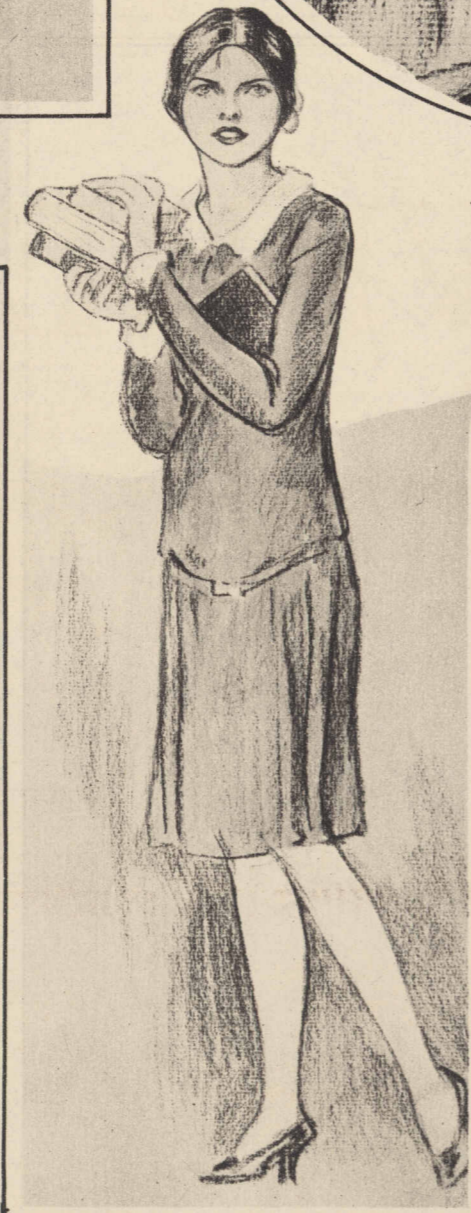
Mary, the highbrow sub-deb, worries the life out of her parents — Mary's idea of snappy repartee being "what do you think of Proust and Keyserling?" This will get Mary about minus ten on flaming youth with the college boys at the Yale-Harvard game.