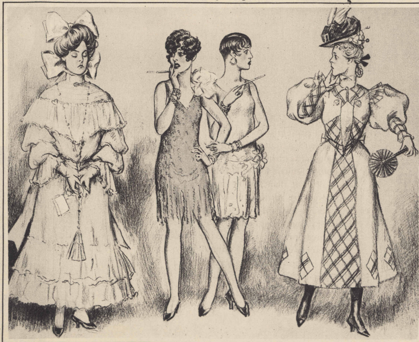
Just to prove once and for all that the good old days were not so hot, we offer this group of sub-debs. The ends are from the dim past when mother was a girl, the center duo is the 1928 model.