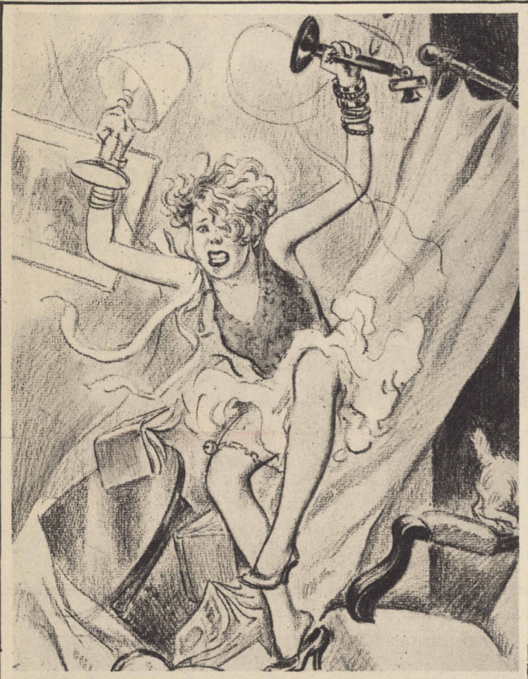
Billie, the little loud speaker, is one of those nerve wracked sub-debs with plenty of money and practically no inhibitions. When crossed by her parents, she goes into the swellest hysterics you ever listened in on, and gets her way every time. Just now Billie is having a tantrum—a loud, destructive one.