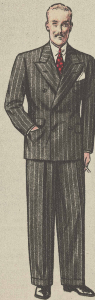
An Ordinary Suit

This man looks shorter than the other although both are exactly the same size.