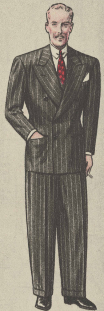
The British Lounge Model*

The human eye is very easily deceived. Look at the little diagram above. The line from A to B looks longer than the line from C to D. Actually, however, they are both exactly the same length. It is simply the art of optical illusion created by changing the position of the arrows at the extremities of each line.