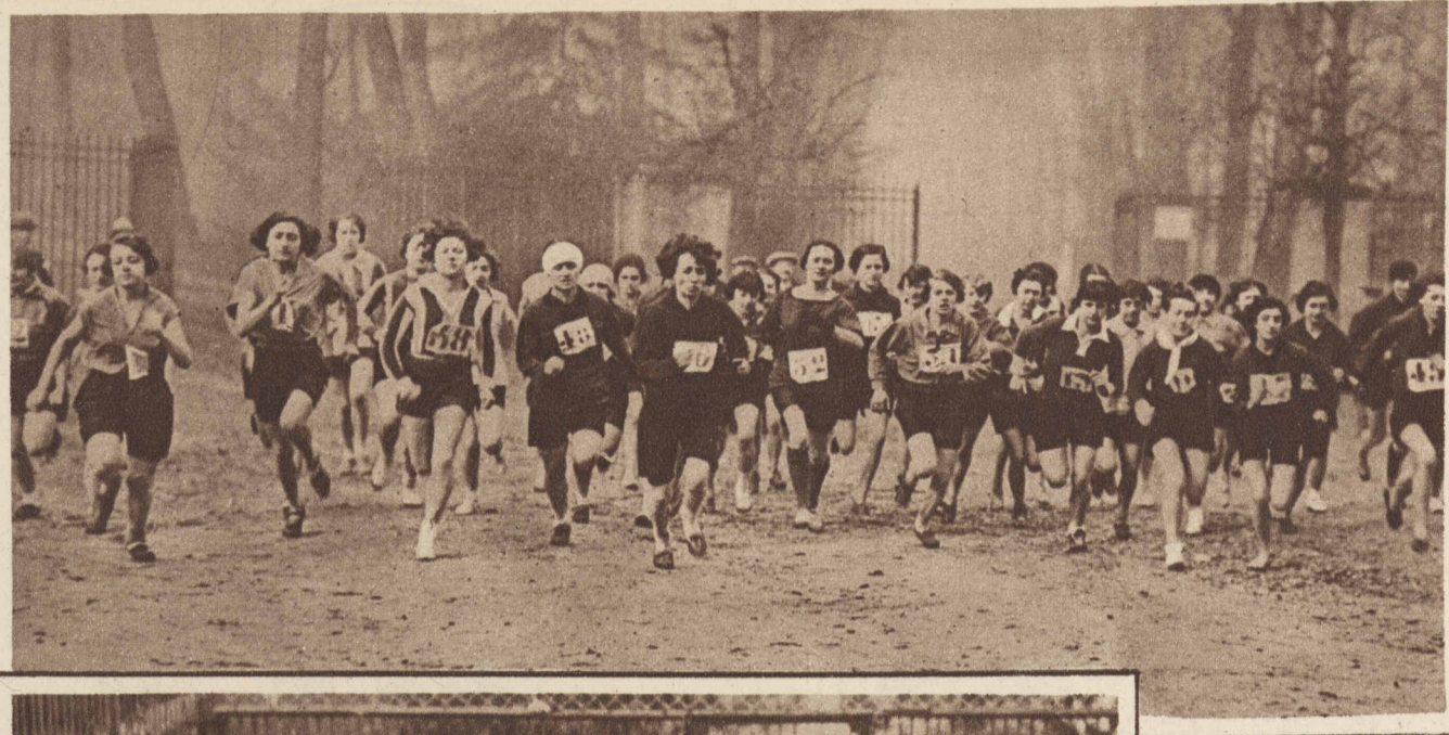
THEY'RE OFF!—Nearly two score of France's fairest started in this cross country race at St. Cloud, with the women's championship at stake.