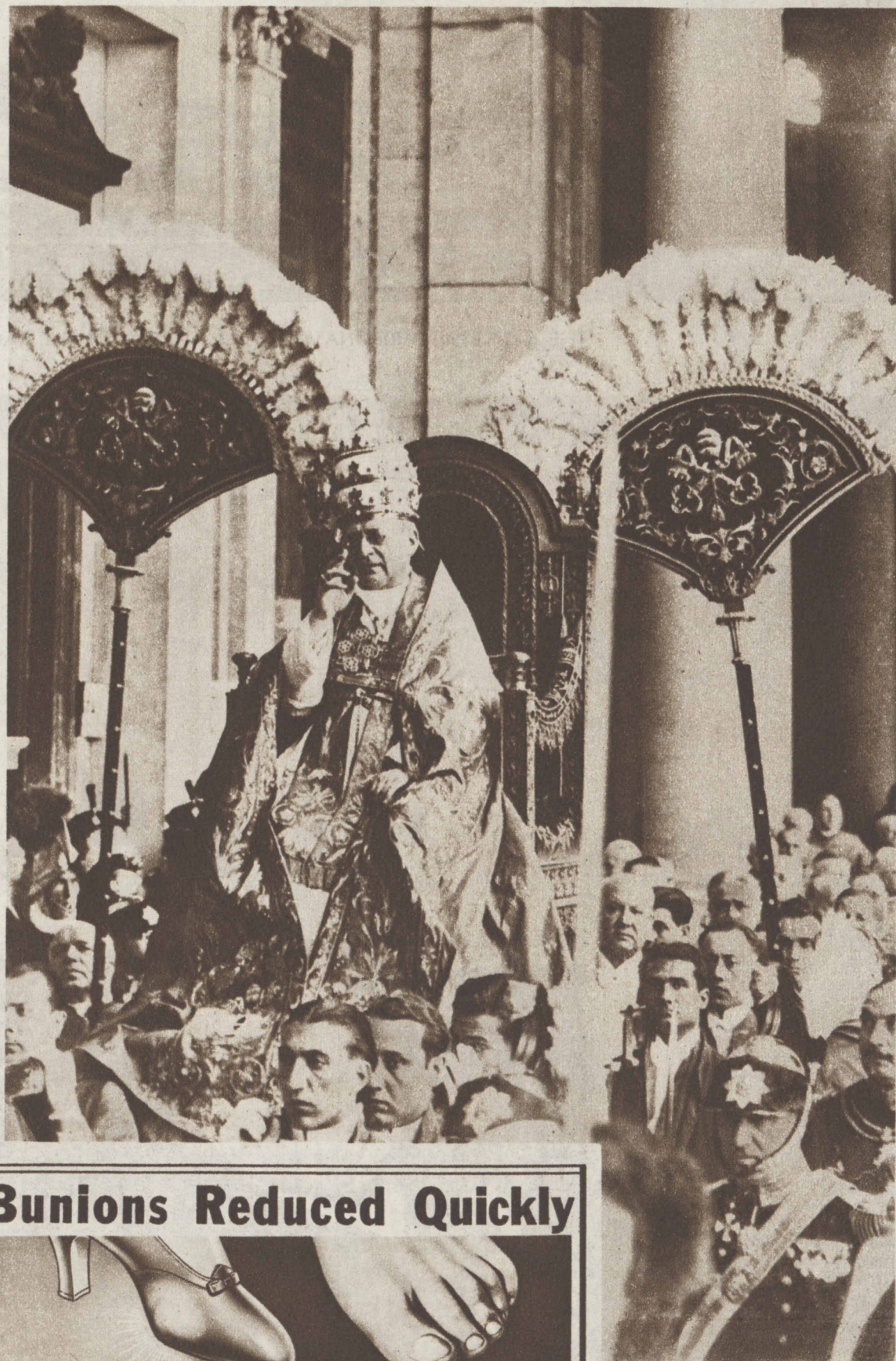
POPE PIUS APPEARS IN OPEN AIR CEREMONY AT THE VATICAN.