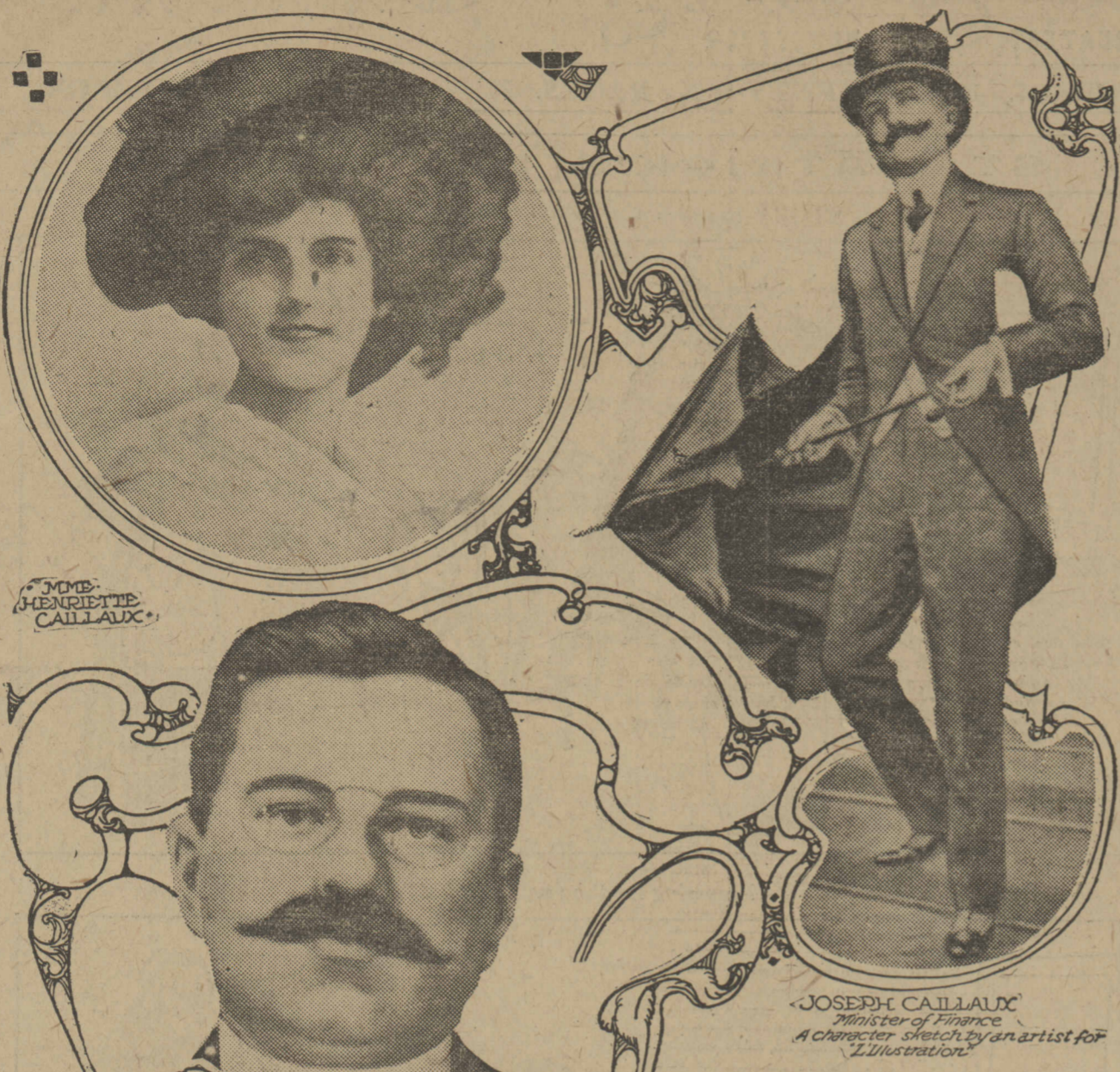
GASTON CALMETTE Editor of Figaro