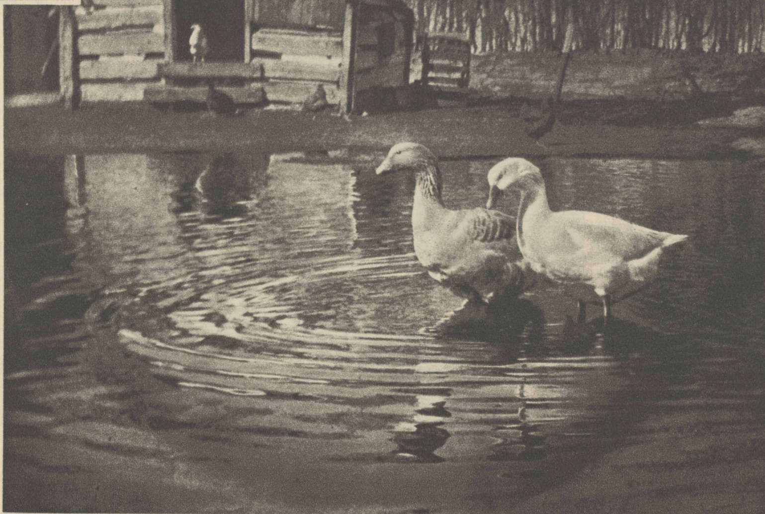
Above: "MAMMA GOES WHERE PAPA GOES."