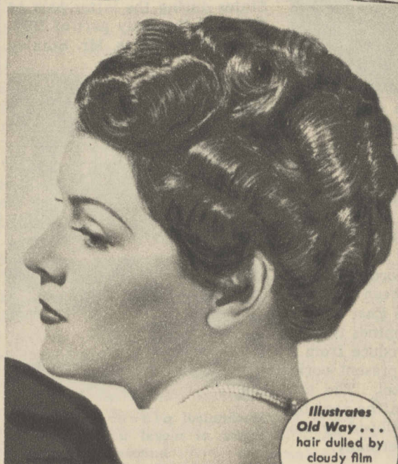
Illustrates Old Way... hair dulled by cloudy film

How one of America's MOST BEAUTIFUL ART MODELS reveals the sparkling loveliness of her hair