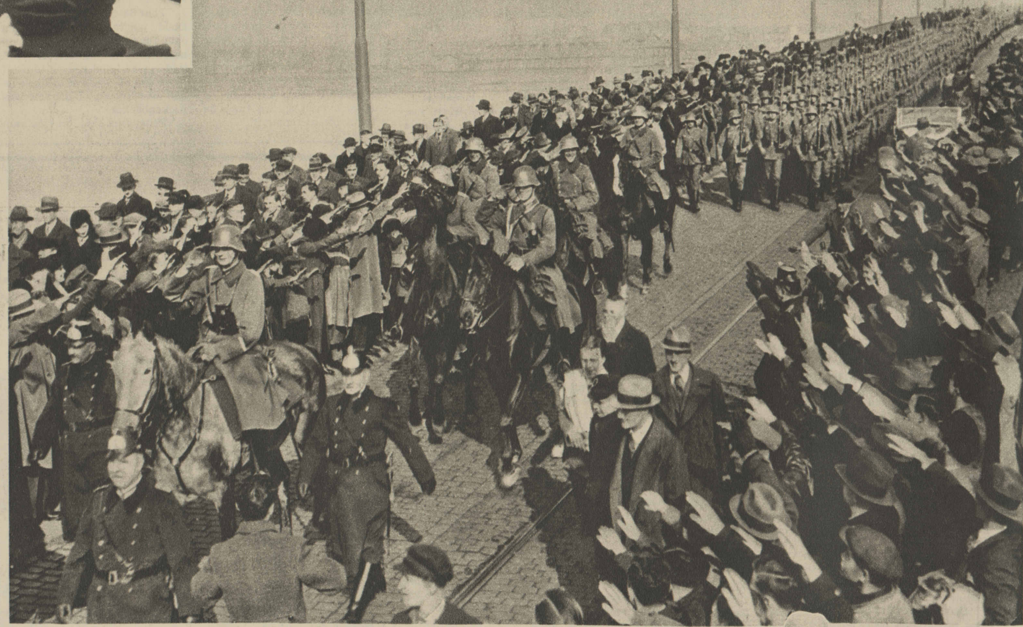
3 Hitler reoccupies the Rhineland—a scene at Mainz, Germany, on March 7, 1936.