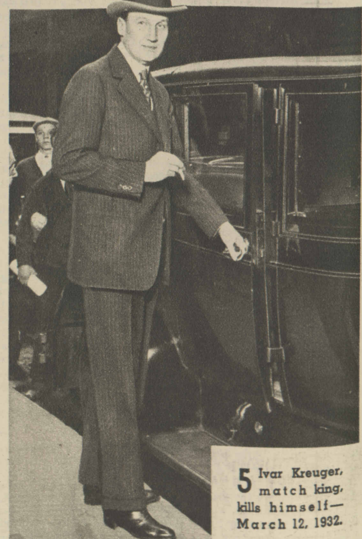
5 Ivar Kreuger, match king, kills himself—March 12, 1932.