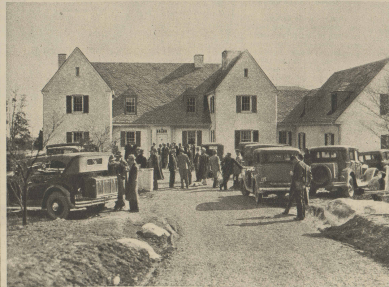
4 Charles Augustus Lindbergh kidnaped—March 1, 1932.