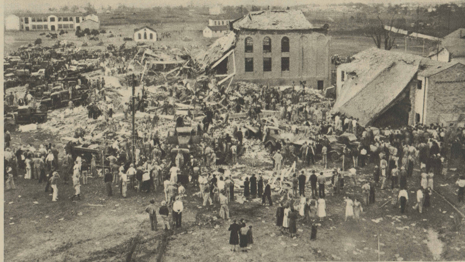
2 More than 400 children killed in New London, Tex., school explosion—March 18, 1937.