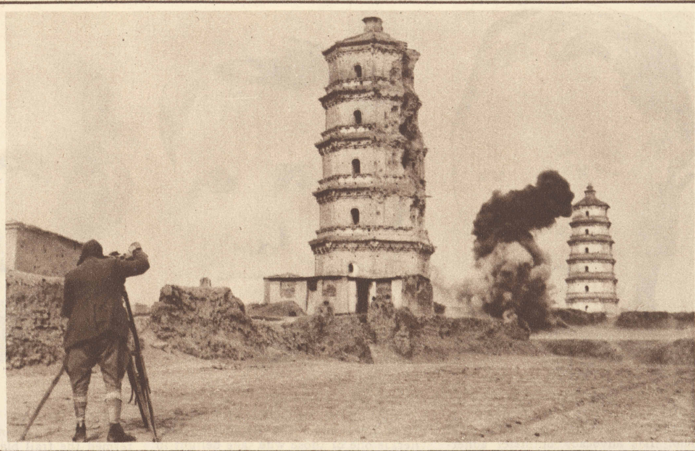
BIG TIME STUFF—A celestial adaptation of the world war "G. I. can" bursts between the pagodas of Chochow as a cameraman cranks a record. Note the shattered walls of the tower in the foreground.

EVERYWHERE you go, note how the cars with Fisher Body stand out. This year, even more than in previous years, it is plain that the cars conspicuous for beauty in every price class are those with Body by Fisher. It is equally obvious that the cars which offer greatest investment value are precisely those cars whose bodies are the product of Fisher artistry, Fisher craftsmanship and Fisher's unrivaled resources