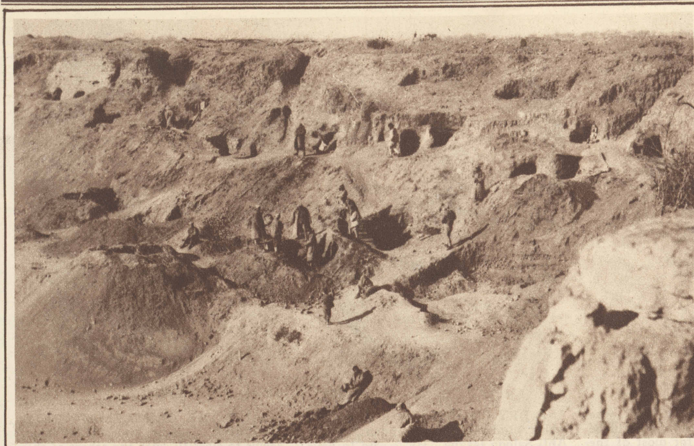
THE CHINESE DOUGHBOY DIGS HIMSELF A FOXHOLE during the eighty-six day siege of Chochow. General Fu, commander of the city, surrendered to the besieger, General Wan Fu-Lin, shortly after this picture was taken.