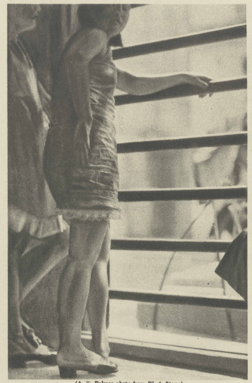
Vice and opium go hand in hand on old Ship street, in the red light district