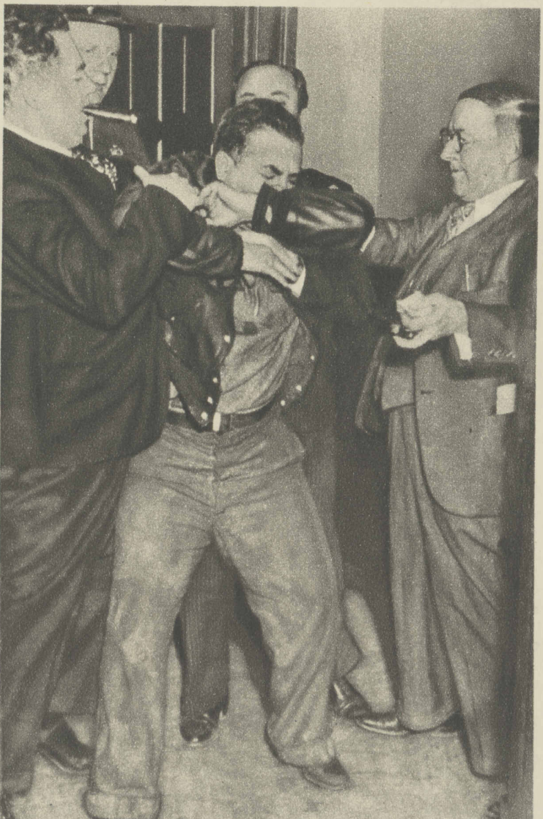
carriage. It was fully six weeks A smuggler is caught. Customs agents at New York arrest one of a group on a British tramp steamer carrying a $500,000 cargo of opium.

"The first day I did very well. felt bright and buoyant, congratulated myself upon my resolve, and felt like informing my fellow passengers what a bold dash I had made for the much-coveted freedom. I slept very well that night, but awoke at 4 a. m. sneezing, which came on in paroxysms and was so severe that it shook me from crown to sole. Then I began to yawn and shiver. Cold chills crept up my back and down into my limbs; flashes of heat alternated, seeming like fire by comparison. Nausea, accompanied by a dull, heavy headache, then came on. By 8 p. m. I was in a pitiable condition; the water was streaming from my burning eyes, extreme restlessness tormented me, and my whole body ached as if I had been beaten. During the night I saw the most horrible things. My valise, upon the floor, seemed to grow into the shape and size of an elephant; strange faces peered at me from the dark corners and in unexpected places. I smelled the most horrible odors. Had I been able to reach the deck I should have thrown myself overboard. As the days went on I mended somewhat and when we reached port was able, with assistance, to walk to a before I left my hotel.