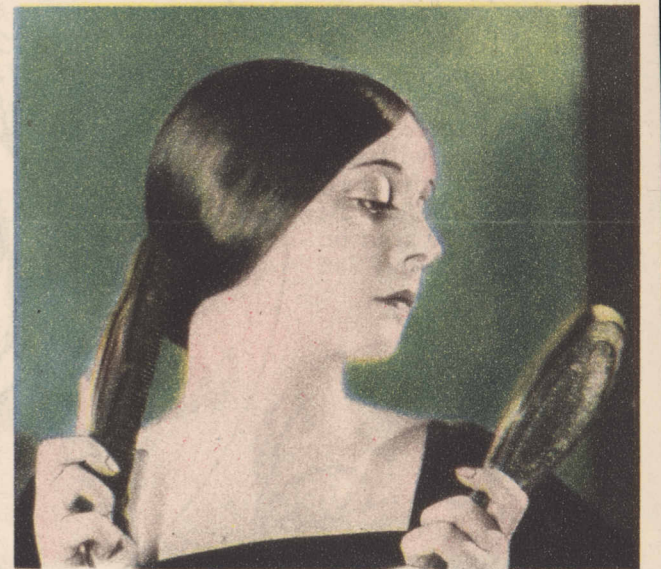
2 Then simply comb this water-like liquid through your hair. CLEAN . . . SAFE. Takes 7 to 10 minutes.