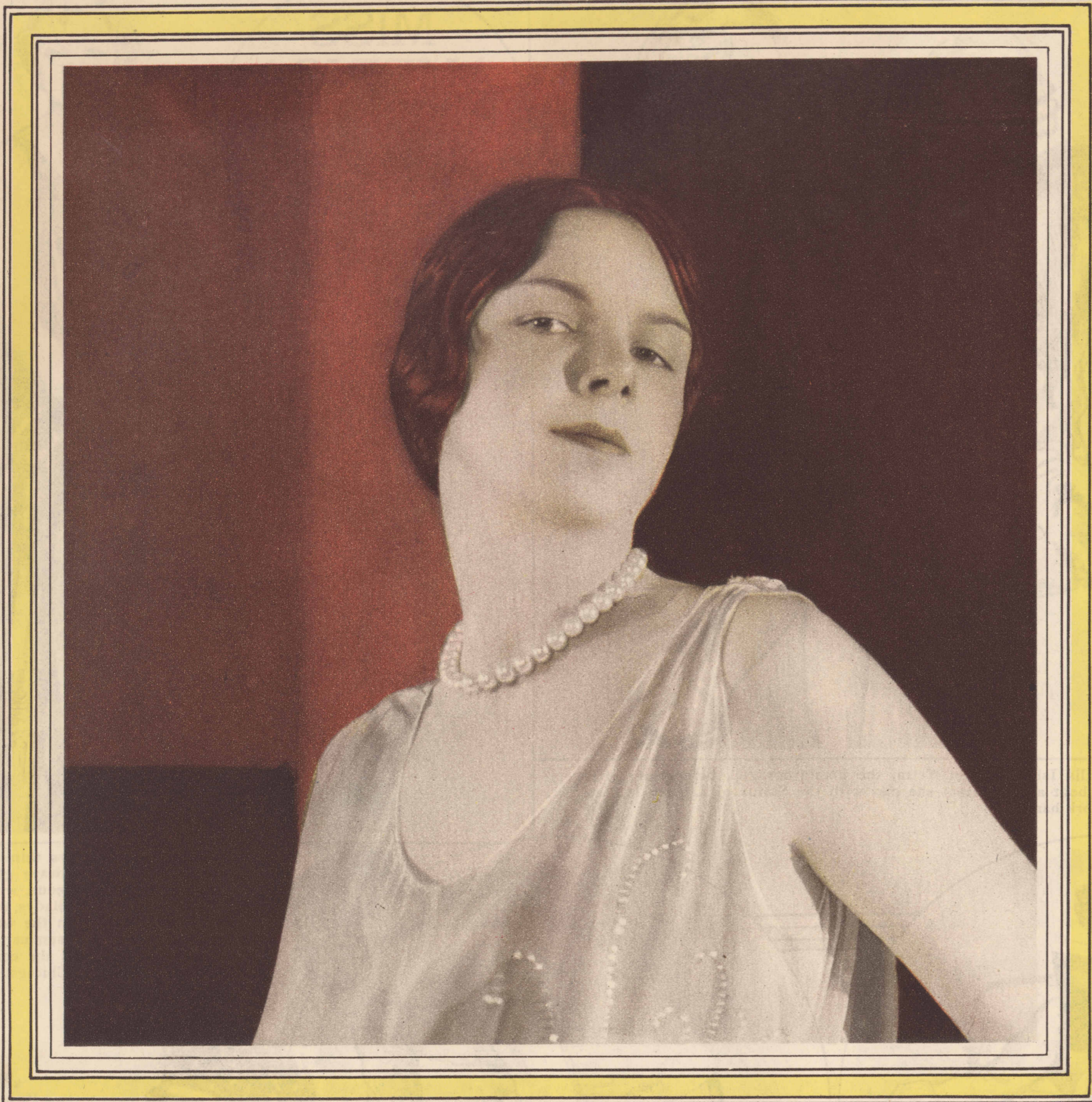
Nothing makes the difference in a woman's age that youthful hair does