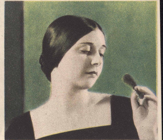
1 You try it first on a single lock of your hair to see what it does. Thus have no fear of results.

One minute, that is all. And when it's over you will see in the single lock color you knew only as a girl. Return this coupon today. Nothing you've ever done has made as great a difference in your age.