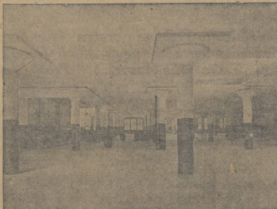
This immense floor is given over to machine shop and repair work—skylights make it a daylight shop.