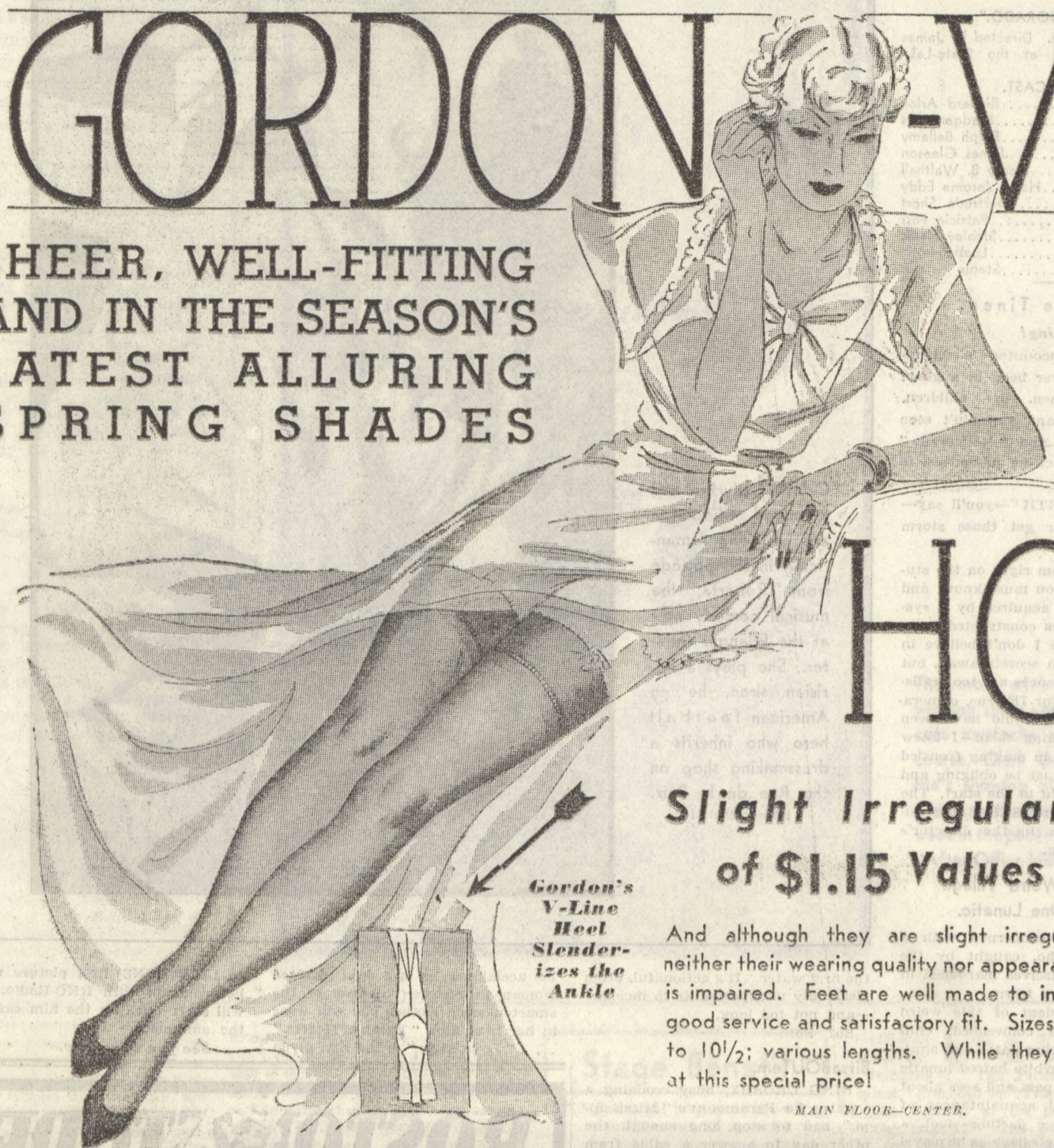
Gordon's V-Line Heel Slenderizes the Ankle

SHEER, WELL-FITTING AND IN THE SEASON'S LATEST ALLURING SPRING SHADES