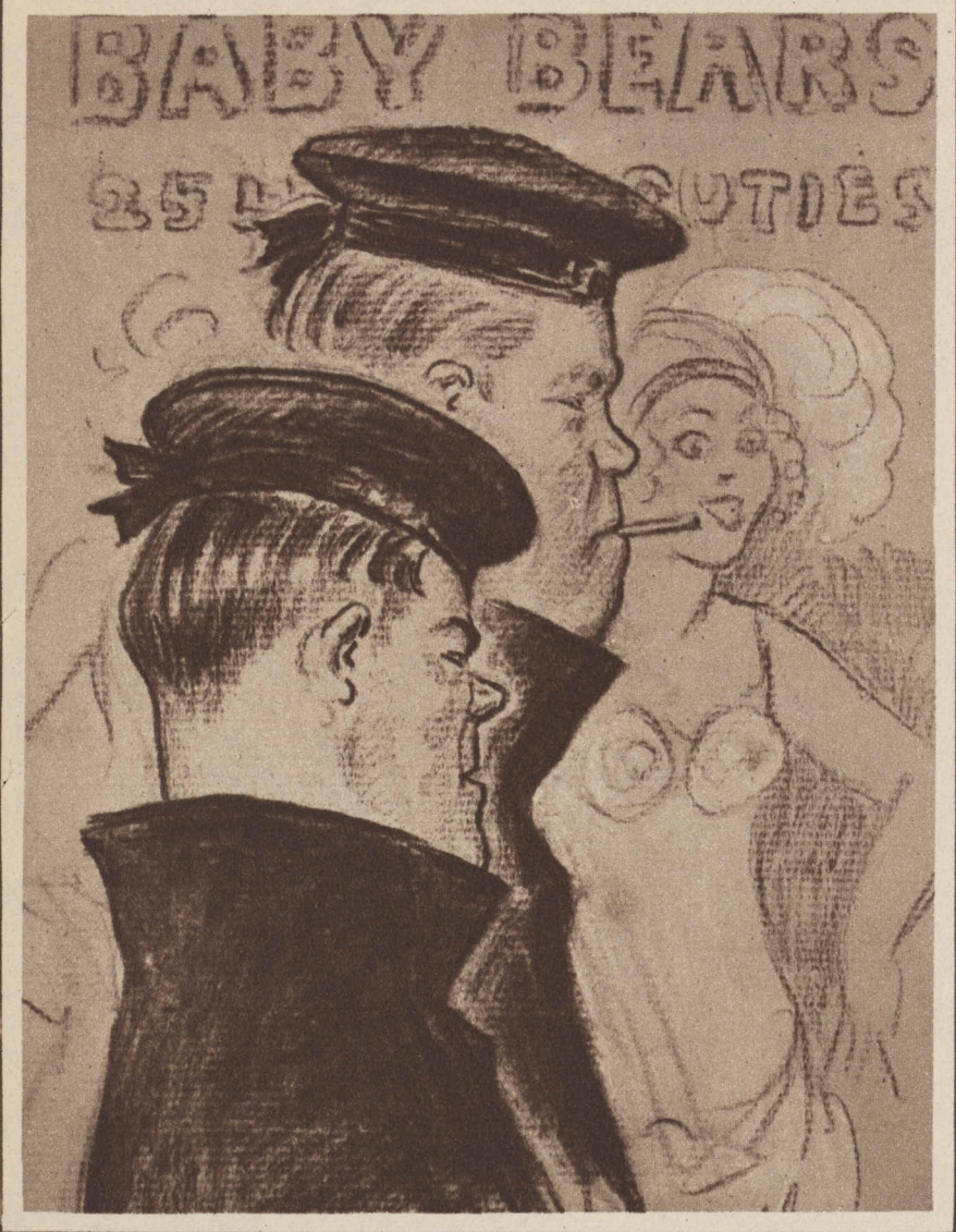
Burlesque. Bud and Pete are about to enter the portals of the Novelty the-ayter, where the Baby Bears, featuring Margy (Hotsey-Totsey) Romaine and her twenty dimpled pepper pots, are holding their own.