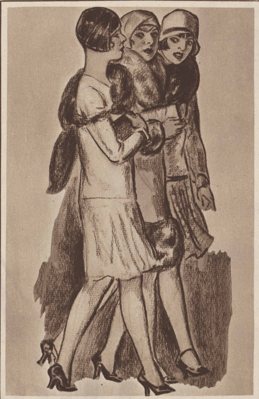
Musical comedy. Mabel and Irene and Babe are stenogs and like a good musical play once in a while—something cute about a poor little girl who marries a rich young man, with the last act set showing a Long Island estate all lit up for a bal masque.