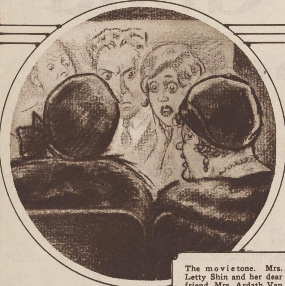
The movietone. Mrs. Letty Shin and her dear friend, Mrs. Ardath Van Schuyler Ginsburg, are enjoying a sound picture. Mrs. Shin is telling Mrs. Ginsburg all about the lump on little Earl Shin's toe, and how it seemed bigger one day and smaller another. Since Mrs. Shin and Mrs. Ginsburg have to raise their voices, many people sitting behind think they are part of the "sound effects."