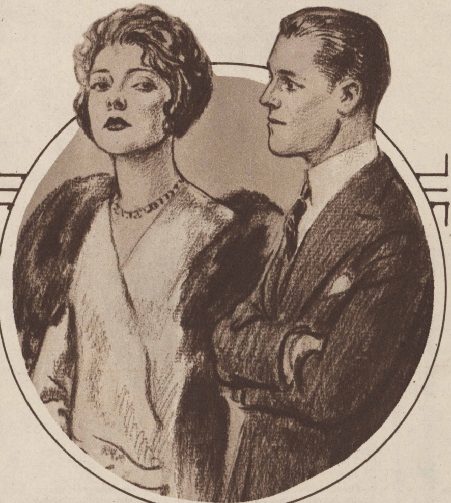
The thriller. Archie and Annabelle like a good mystery play—"The Speckled Claw" or "The Crunch" or "The Scream in the Space," just to mention a few old favorites. Something with reaching out of hands, trapdoors, and groans from overhead while lightning flashes hits them just about right.