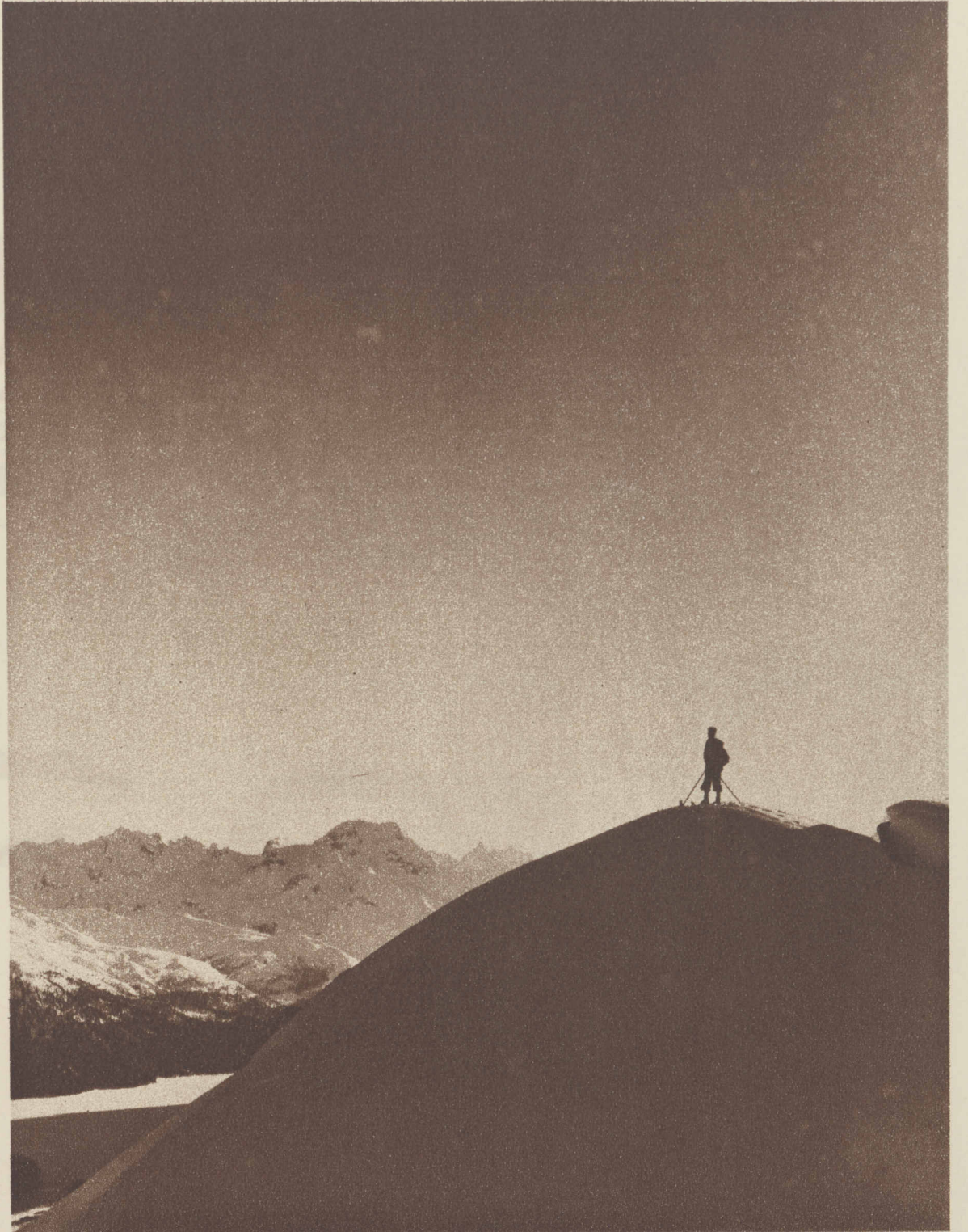
ALPINE SILHOUETTE.