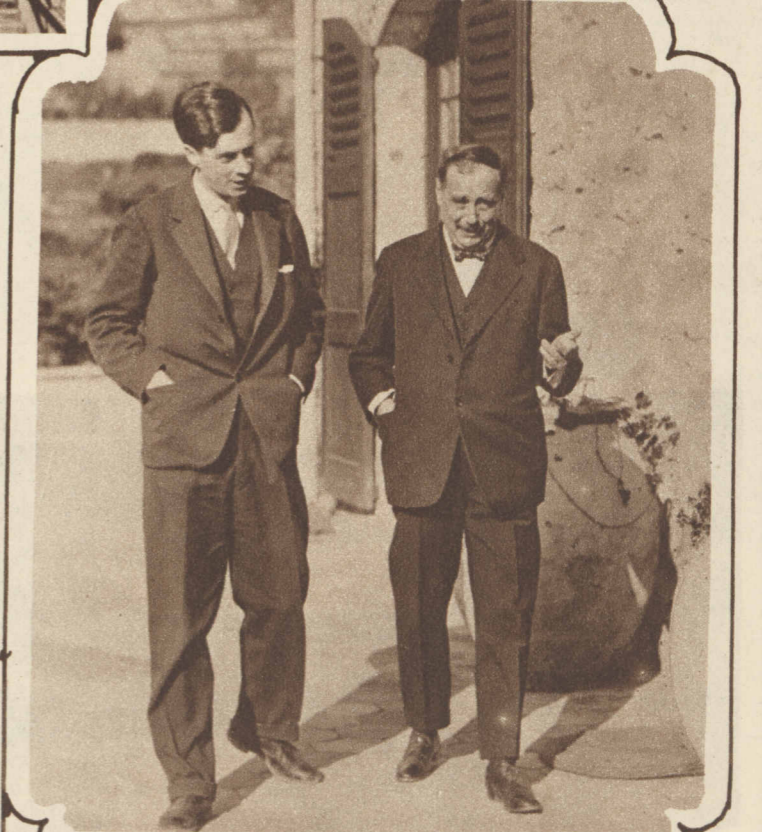
LITERATURE IN THE MAKING—Behold H. G. Wells, at the right, walking and talking with J. S. Huxley, English scientist, with whom the celebrated author is collaborating in preparation of "The Science of Life." The scene is Lou Pidou, one of Mr. Wells' two villas on the Riviera, near the Mediterranean. This villa is his workshop, from which visitors are barred; guests are welcomed at the other.