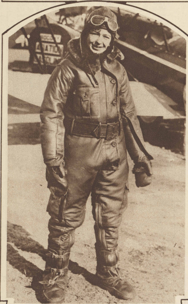
WORLD'S RECORD BREAKER, Elinor Smith, 17, who remained in the air 13 hours and 16 minutes, surpassing the previous endurance mark for women pilots by 1 hour and 5 minutes. Her feat was accomplished in an open cockpit machine and in the face of a bitterly cold wind.