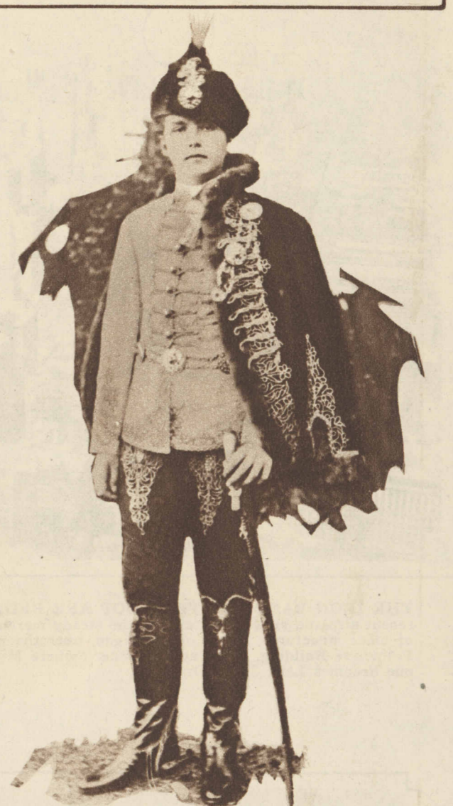
A KING WITHOUT A THRONE—Royalists of Hungary are seeking to bring to power Otto, son of the last Hapsburg emperor of Austria-Hungary. This recent picture is being circulated in his native country by supporters of the young exile.