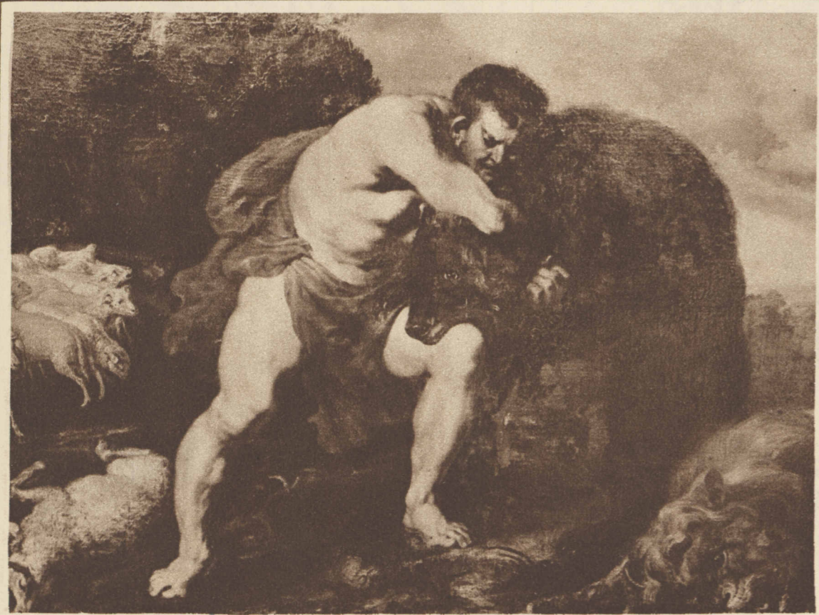
A LONG-LOST PAINTING, Peter Paul Rubens' conception of David's fight with the bear, has been brought to light by a Berlin art dealer, and authorities have pronounced it genuine.