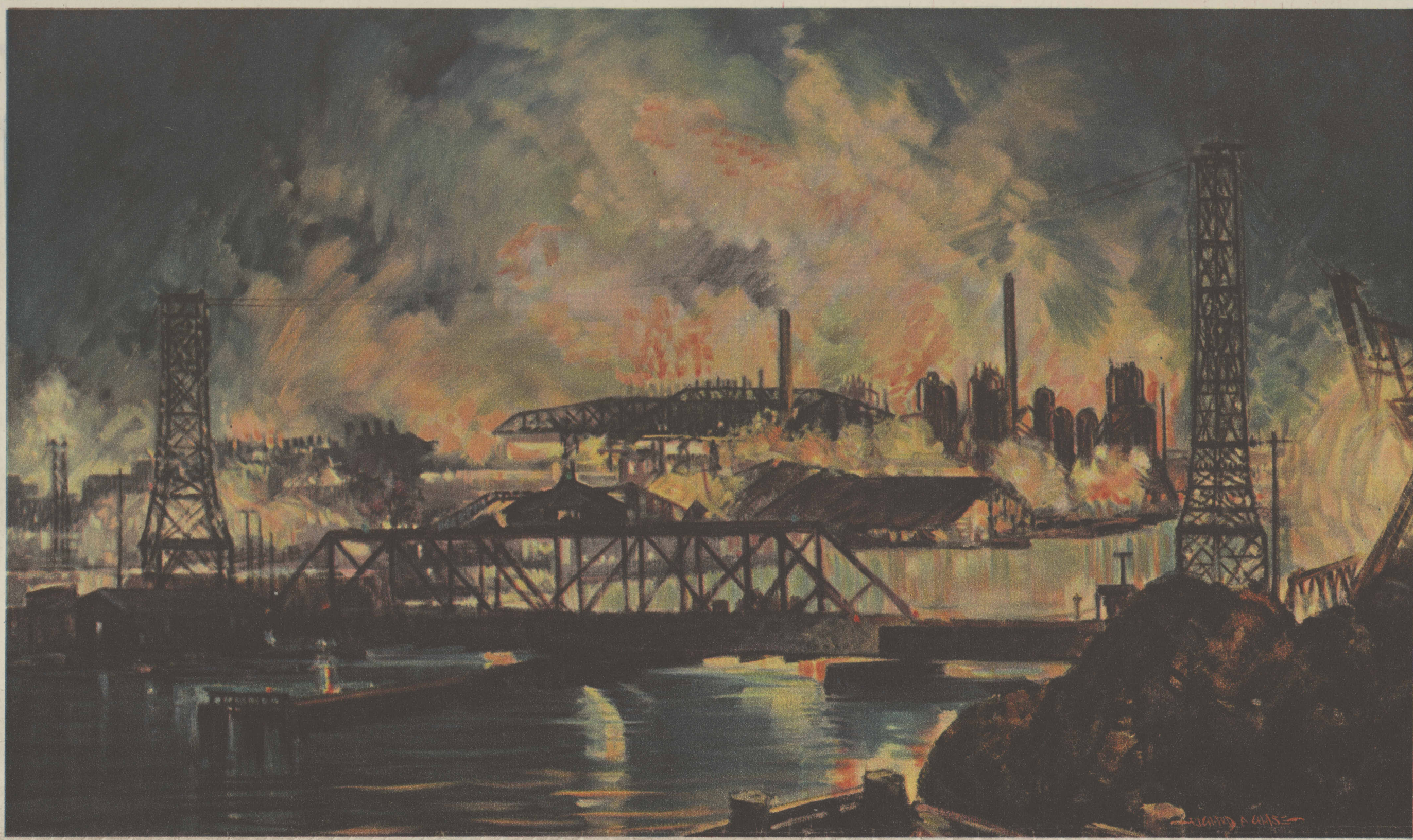
PILLARS OF FIRE BY NIGHT —In "Steel Mills at Night" Richard A. Chase dips his brush into the flaming colors that light the darkened sky of Chicago's far south side, interpreting the roaring, seething activity of one of the world's leading steel centers. Here, in the production of the national basic commodity, is one of the essential factors of the city's greatness; and here the apotheosis of the surging power for which Chicago is known to the far corners of the earth.