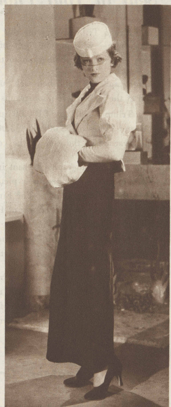
MYRNA LOY models this black velvet dress with blouse of silver lame, worn with hat, coat and muff of white galyak. The hat is trimmed with a transparent visor.