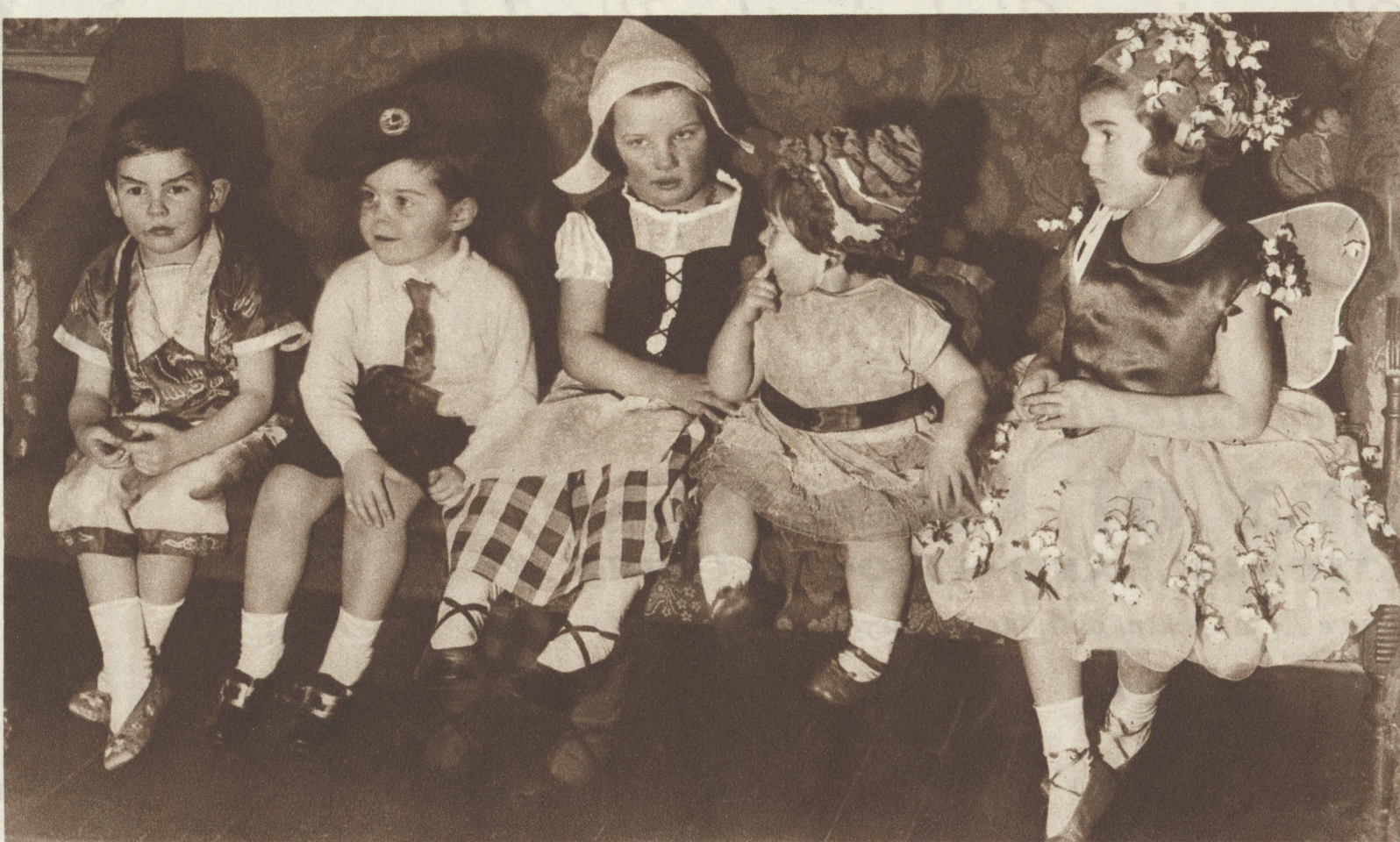
IN FANCY DRESS at a London children's party.