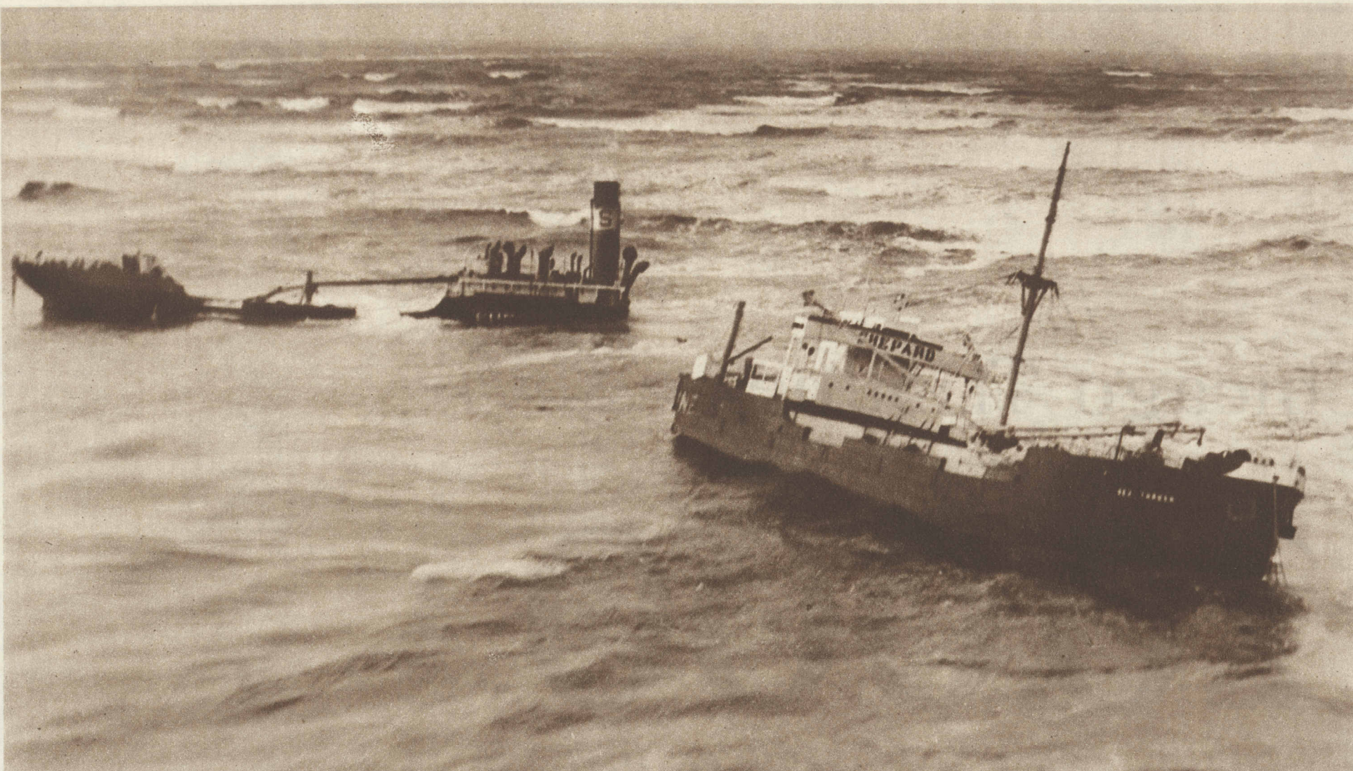
AFTER RUNNING AGROUND south of the mouth of the Columbia river, off the Oregon coast, the steamer Sea Thrush is broken in two by storm and tide.