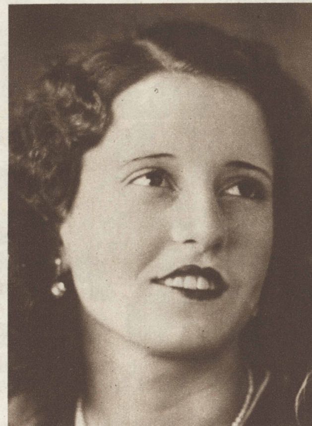
C. A. C. Bloomington, Illinois.