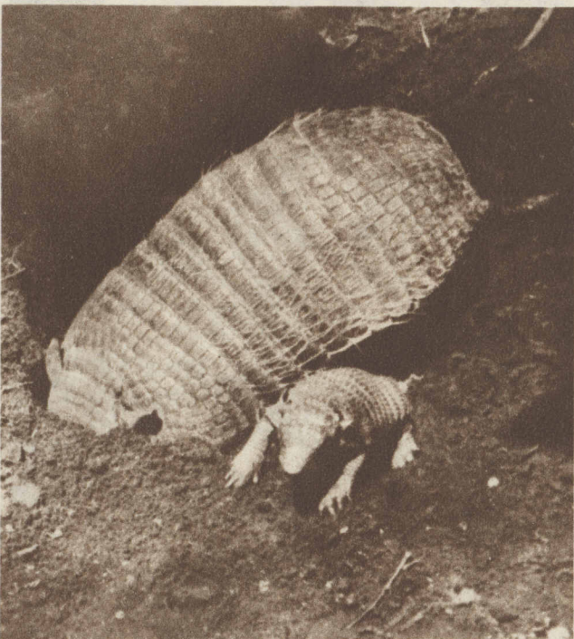
A NINE-BANDED ARMADILLO and its four day old offspring at the Philadelphia zoo.