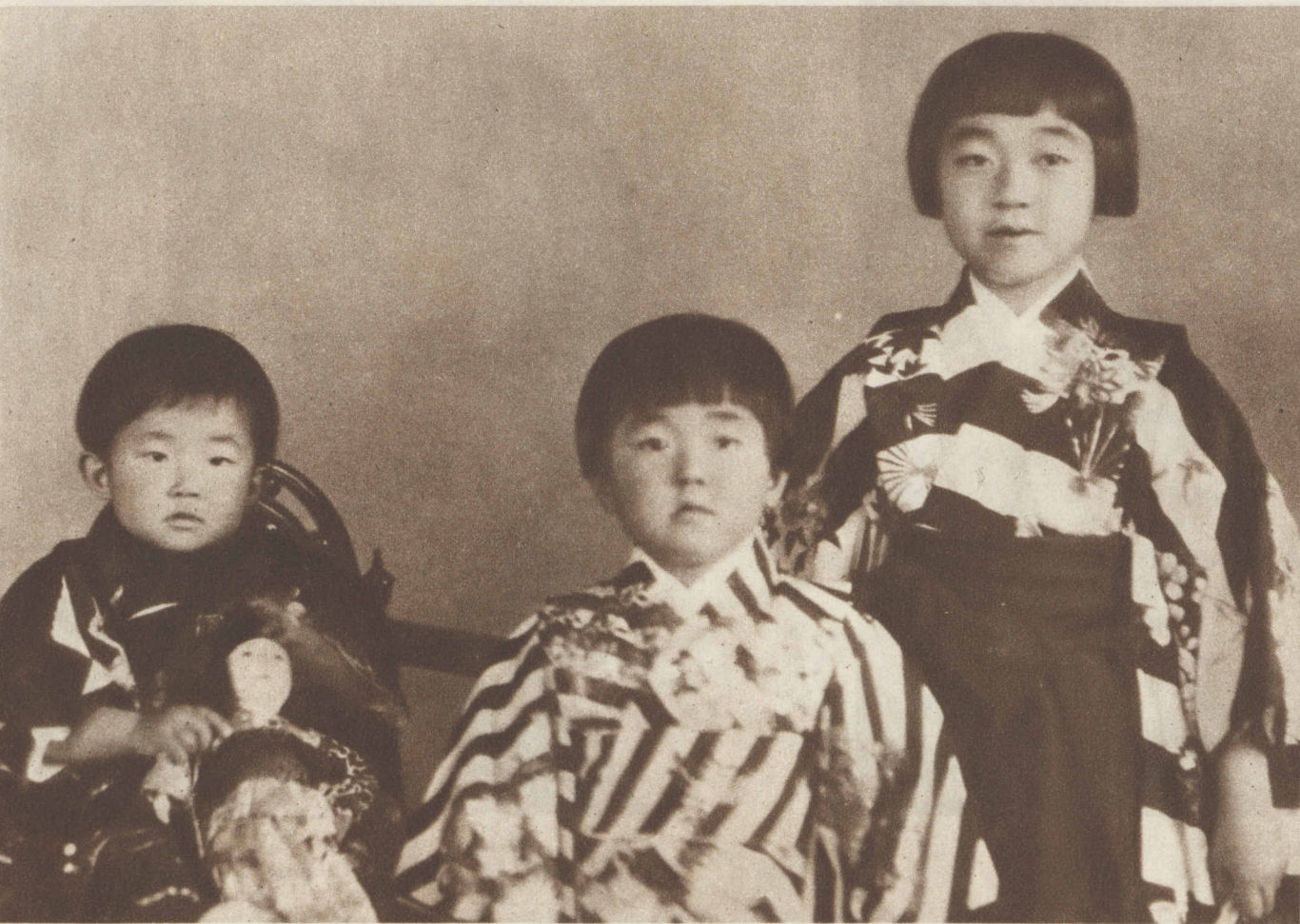
ATSUKO YORI, KAZUKO TAKA, AND SHIREKO TERU, the youngest at the left, the eldest at the right, are the three daughters of the Emperor and Empress of Japan.