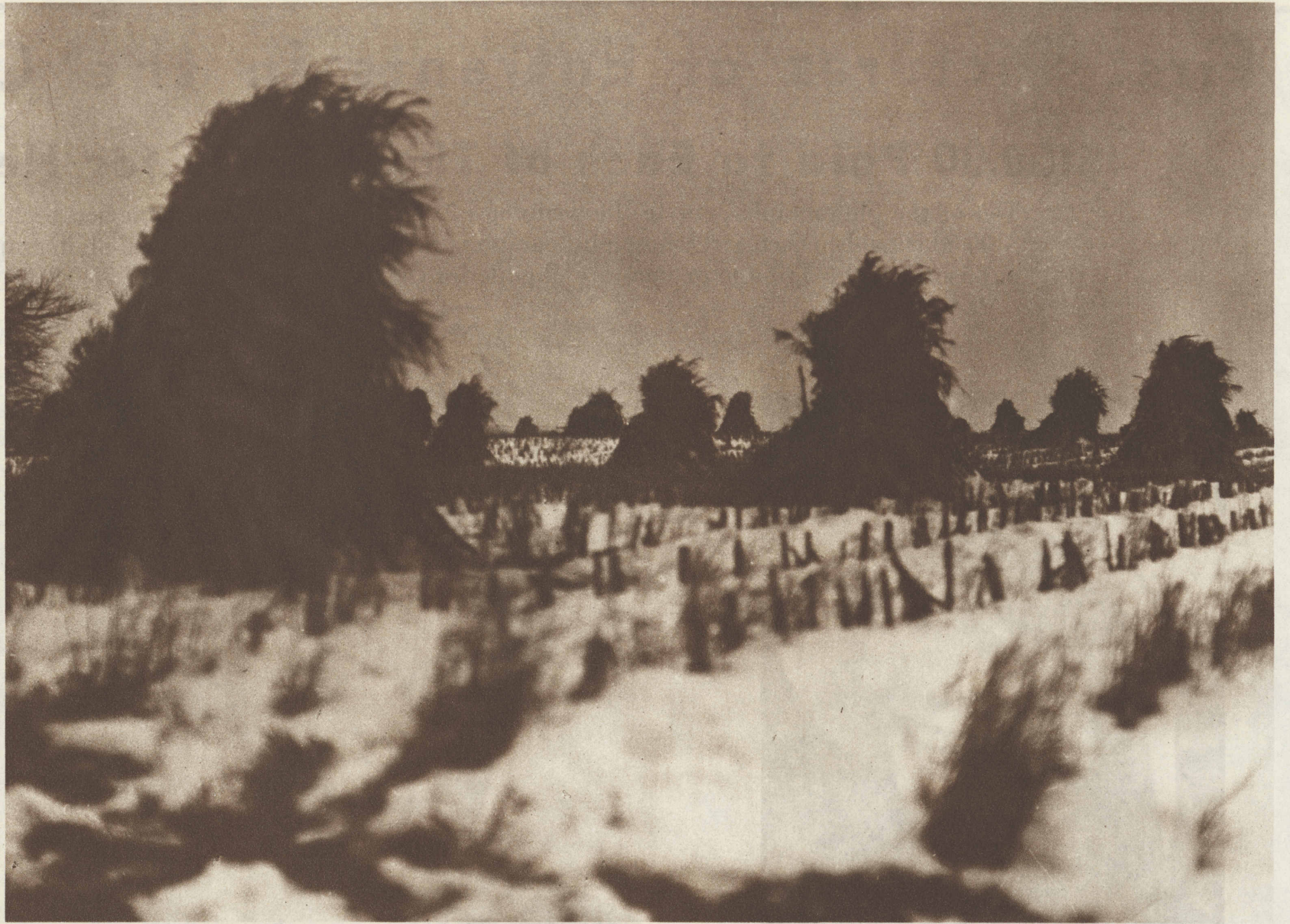
CORNFIELD IN WINTER.