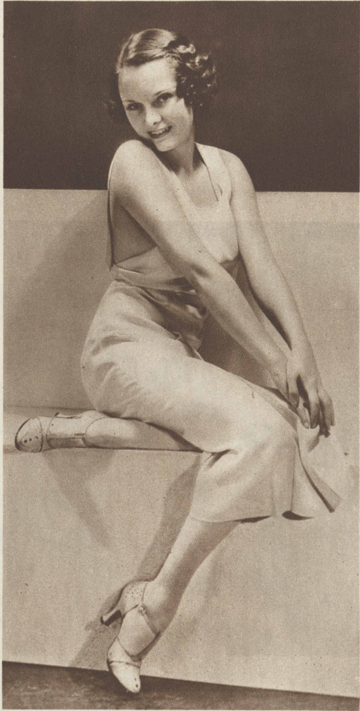
BEACH ENSEMBLE —A dress of pale beige silk worn with perforated sandals.