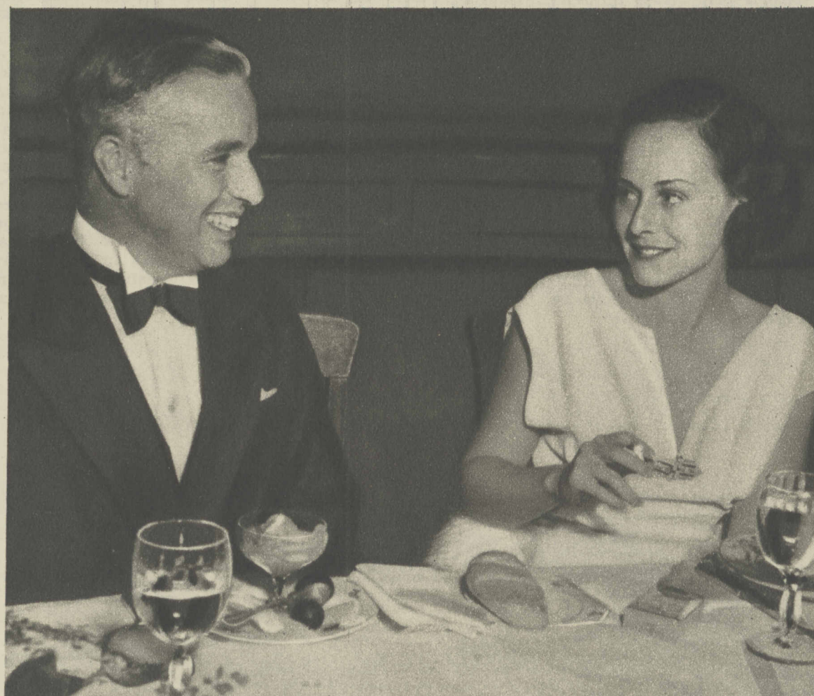
CHARLES CHAPLIN and PAULETTE GODDARD.. a broken romance: one more picture for him, possibly none for her.

OLIVIA DE HAVILLAND may look forward to a good year, with Venus well aspected, bringing (Continued on page ten.)