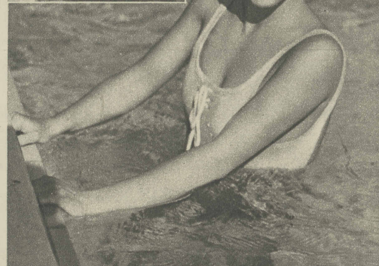
JOAN CRAWFORD . . . success in work, vexation in personal matters.

him in his career this year. A busy year in pictures lies ahead. Some mystery connected with the water will put him in headlines. He will make a journey affecting his business favorably. Curious secrets and strange matters mark this period in his life. He is in danger of an accident. Escaping this, nothing can hold him back in pictures this year.