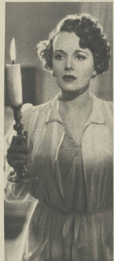
MARY ASTOR . . . danger to present marriage forecast.

DOLORES COSTELLO has a year to be marked with much