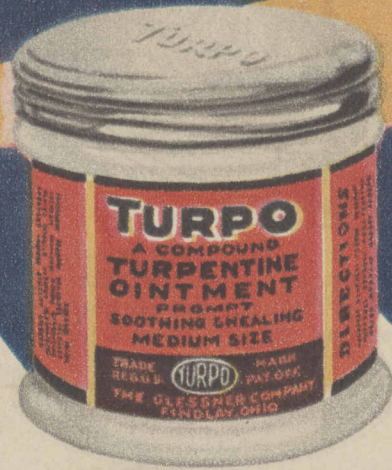
JUST PLUG TURPO