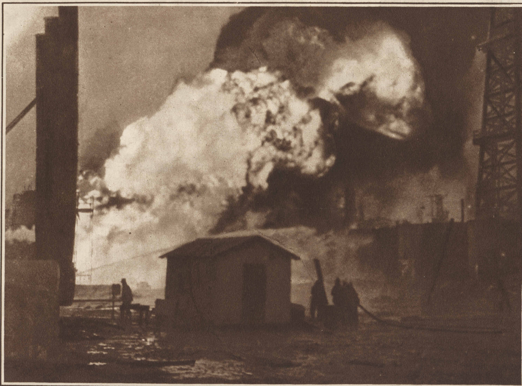
THIS FIRE in the Signal Hill oil section near Long Beach, Cal., broke out in the midst of a torrential rain. It caused property damage estimated at over $25,000 and personal injury to several workers.