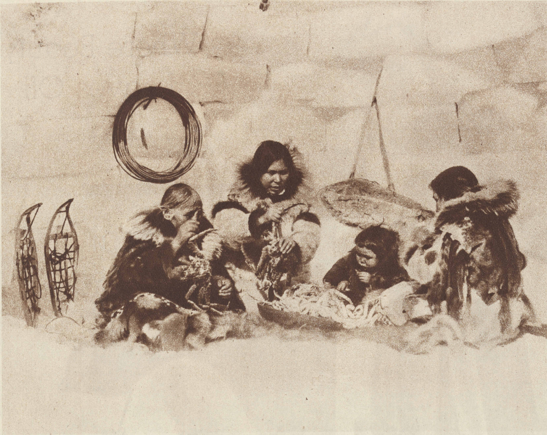
WINTER IN ESKIMO- LAND—A family in Alaska's far north sits down to a dinner of crabs.