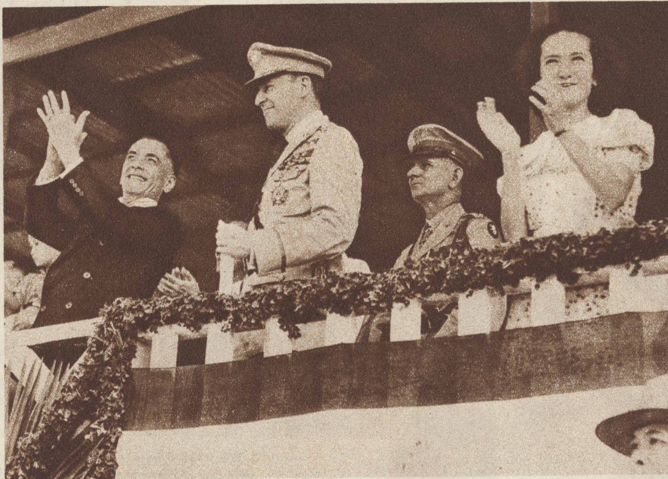
APPLAUSE FOR A MANILA SPECTACLE— President Manuel Quezon (left) and his daughter (right) express pleasure with a military display on the first anniversary of establishment of the Philippine commonwealth. Center, Gen. Douglas MacArthur, military ad- viser to the island regime.