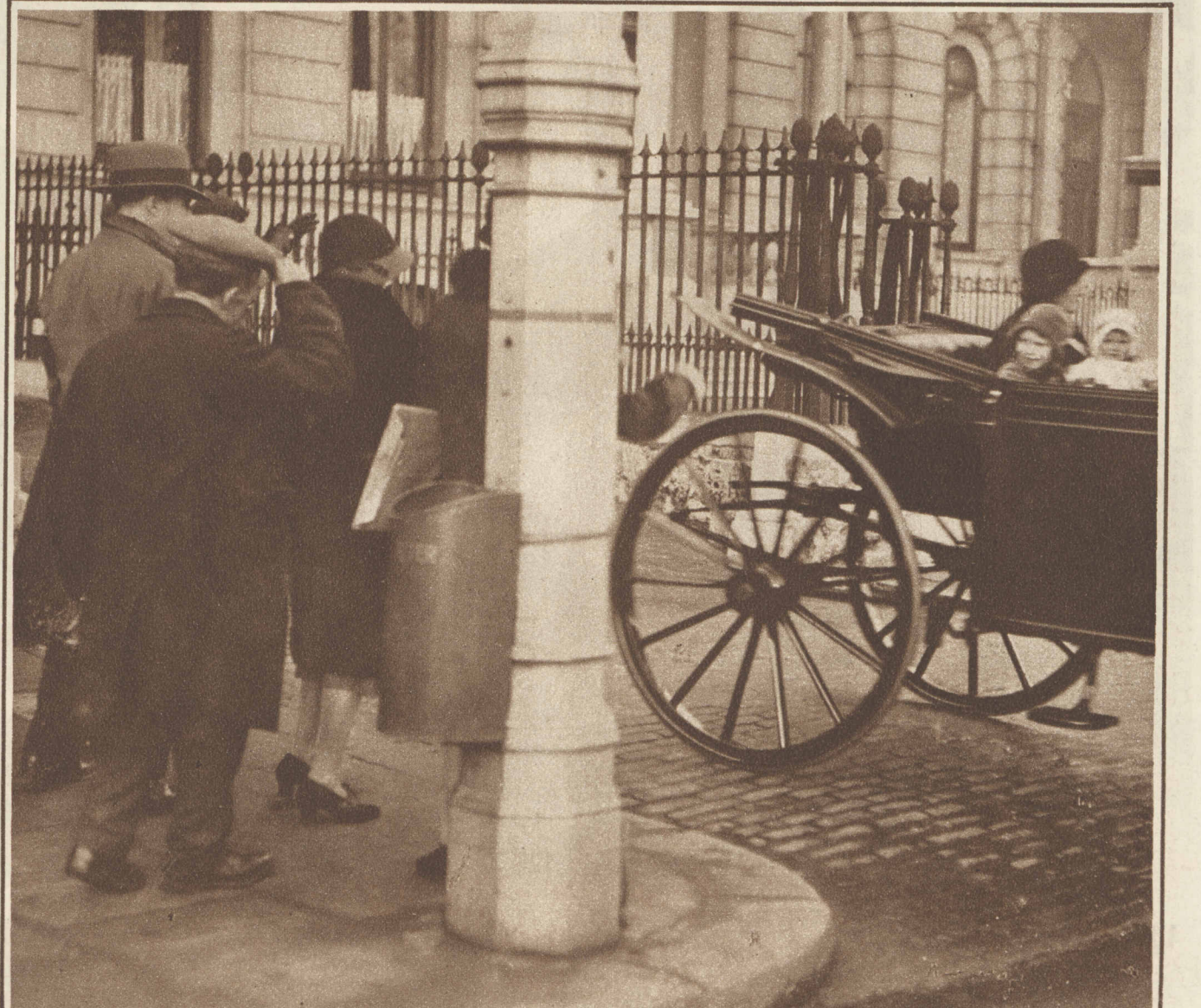
PASSERS-BY GREET THE BABY PRINCESSES, Elizabeth and Margaret, daughters of the duke and duchess of York, as they leave for their daily drive in London.