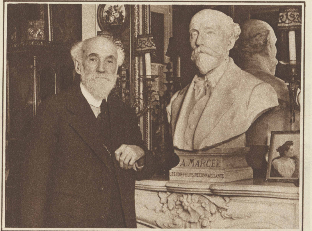
MILLIONS OF WOMEN HAVE SPENT MILLIONS OF DOLLARS because of this seventy-nine year old Frenchman's admiration for his mother's wavy hair. He is Monsieur Marcel Grateau, inventor of the hair wave which bears his given name. He lives in retirement near Paris and is shown with the bust presented to him ten years ago by the coiffeurs of the city.