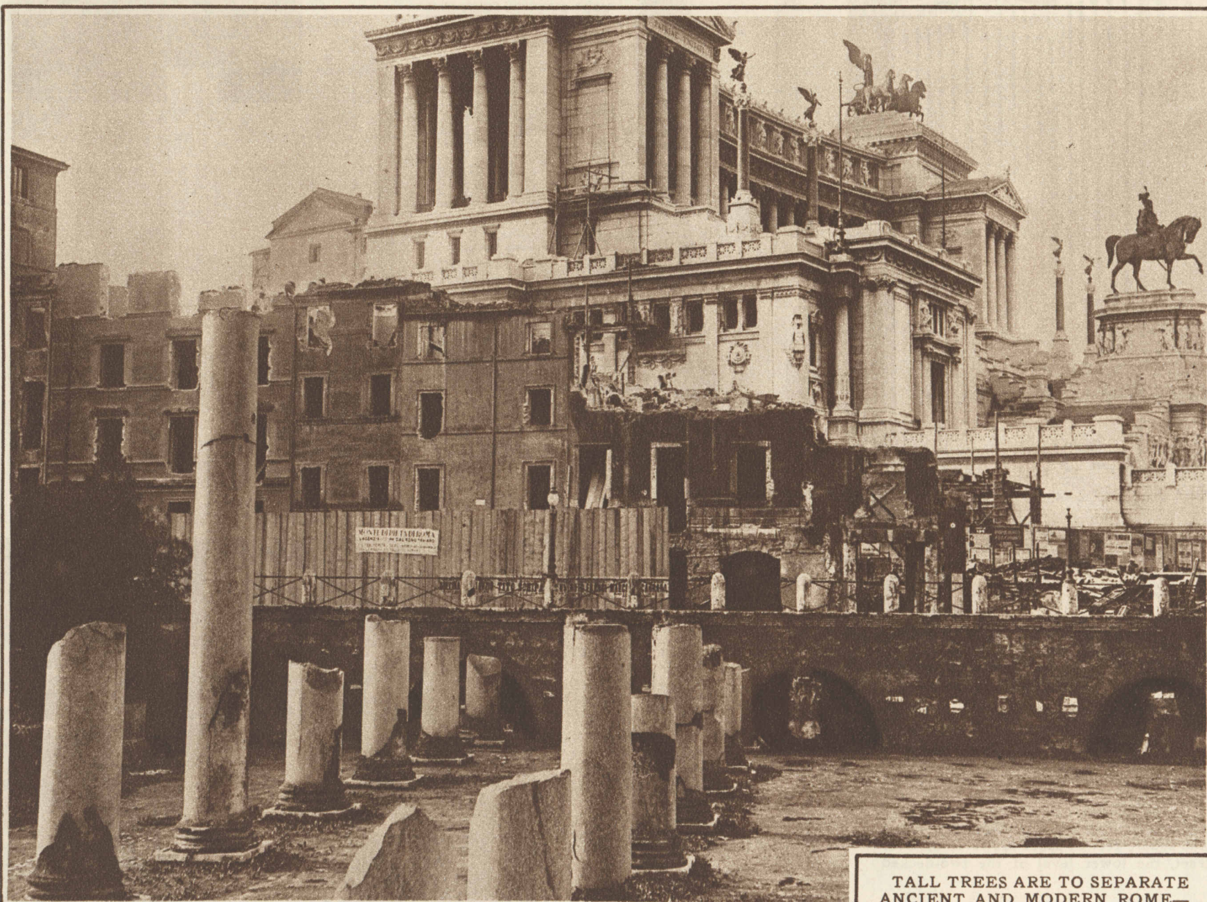
TALL TREES ARE TO SEPARATE ANCIENT AND MODERN ROME —The buildings between the ancient Forum of Trajan, in the foreground, and the modern monument to Victor Emmanuel II. are being razed. High trees are to be planted here to screen off the monument because Romans complain that its glaring whiteness is out of harmony with the rest of the city's architecture.