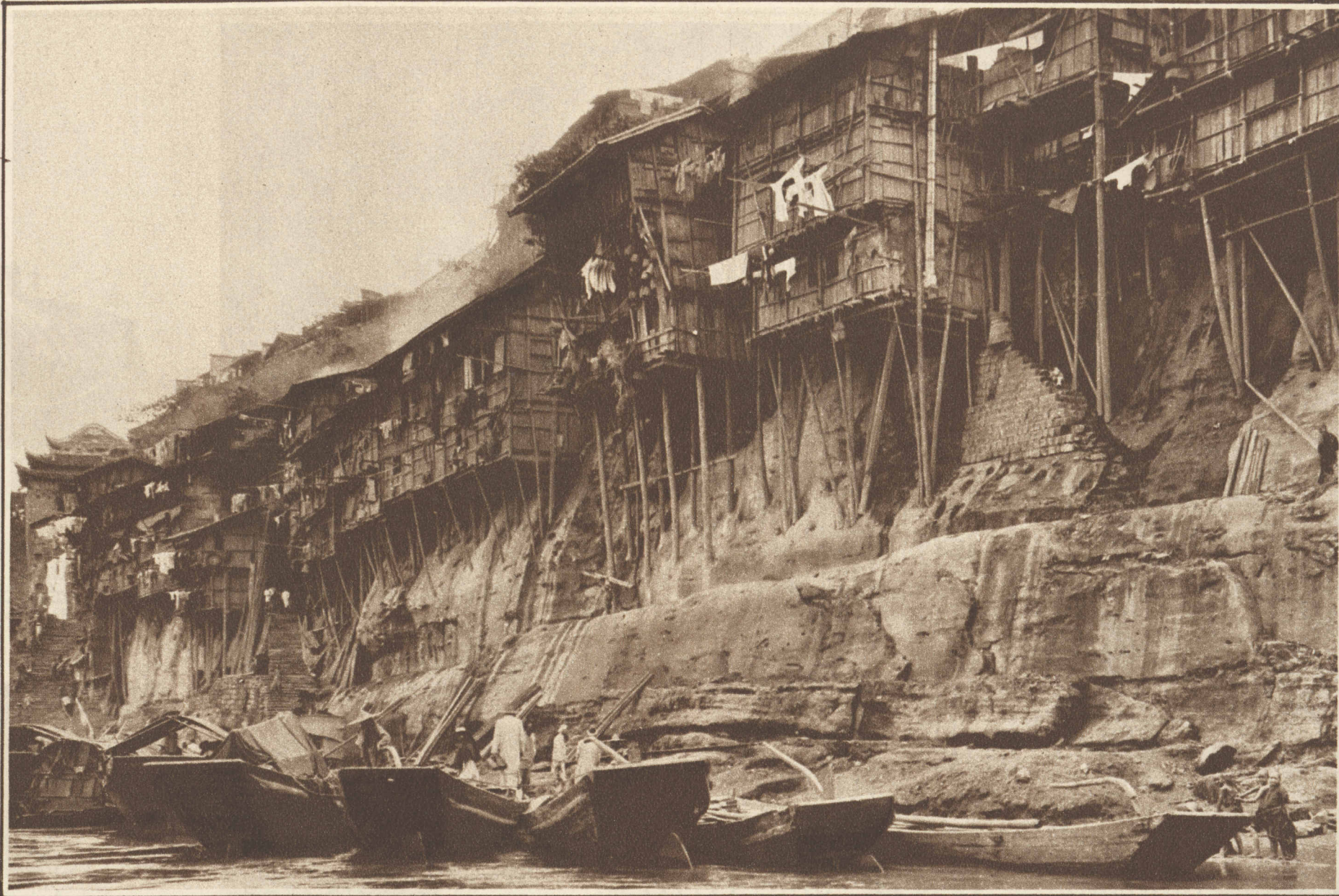
CHINESE CLIFF DWELLINGS —These precariously perched houses along the Yangtze river in Chungking are built by the poorer natives, who find that nobody holds property rights to the steep banks of the river and that they may live in these bamboo pole supported shacks without paying rent.