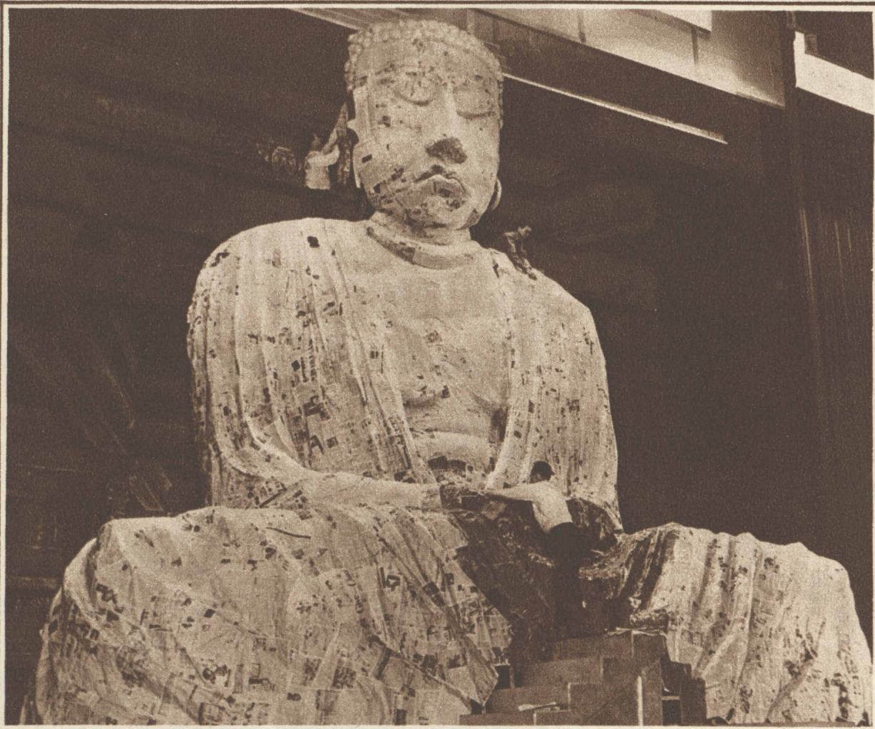
A NEWSPAPER BUDDHA —This unique statue, twenty-five feet high, and constructed of old newspapers, looked down upon the dancers at the University of Washington ball at the civic auditorium in Seattle. The idol was gilded and colored lights played upon it during the ball.