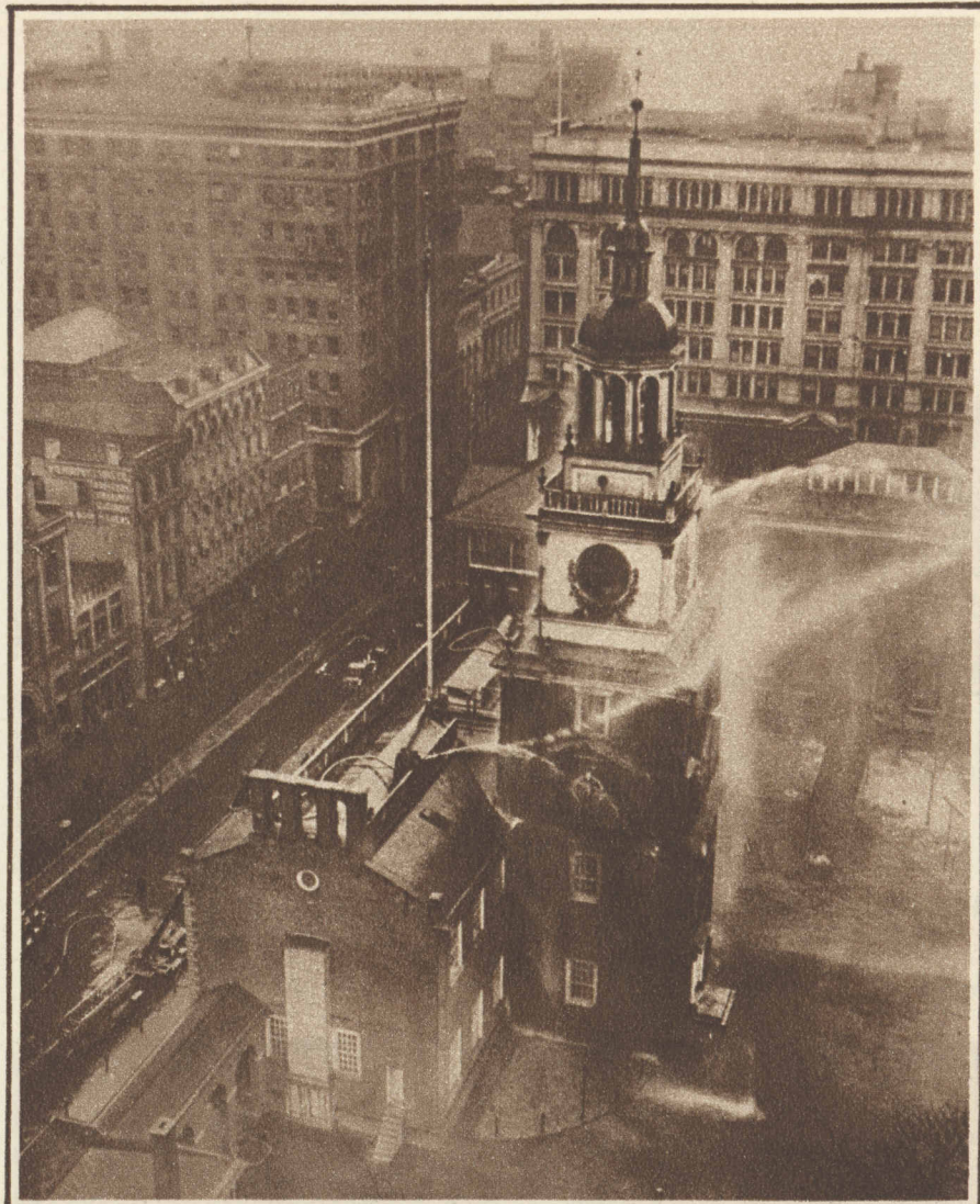
THE CRADLE OF LIBERTY, Independence hall in Philadelphia, was recently the scene of a drill by the city's fire department, during which this photograph was made from a higher adjoining structure.