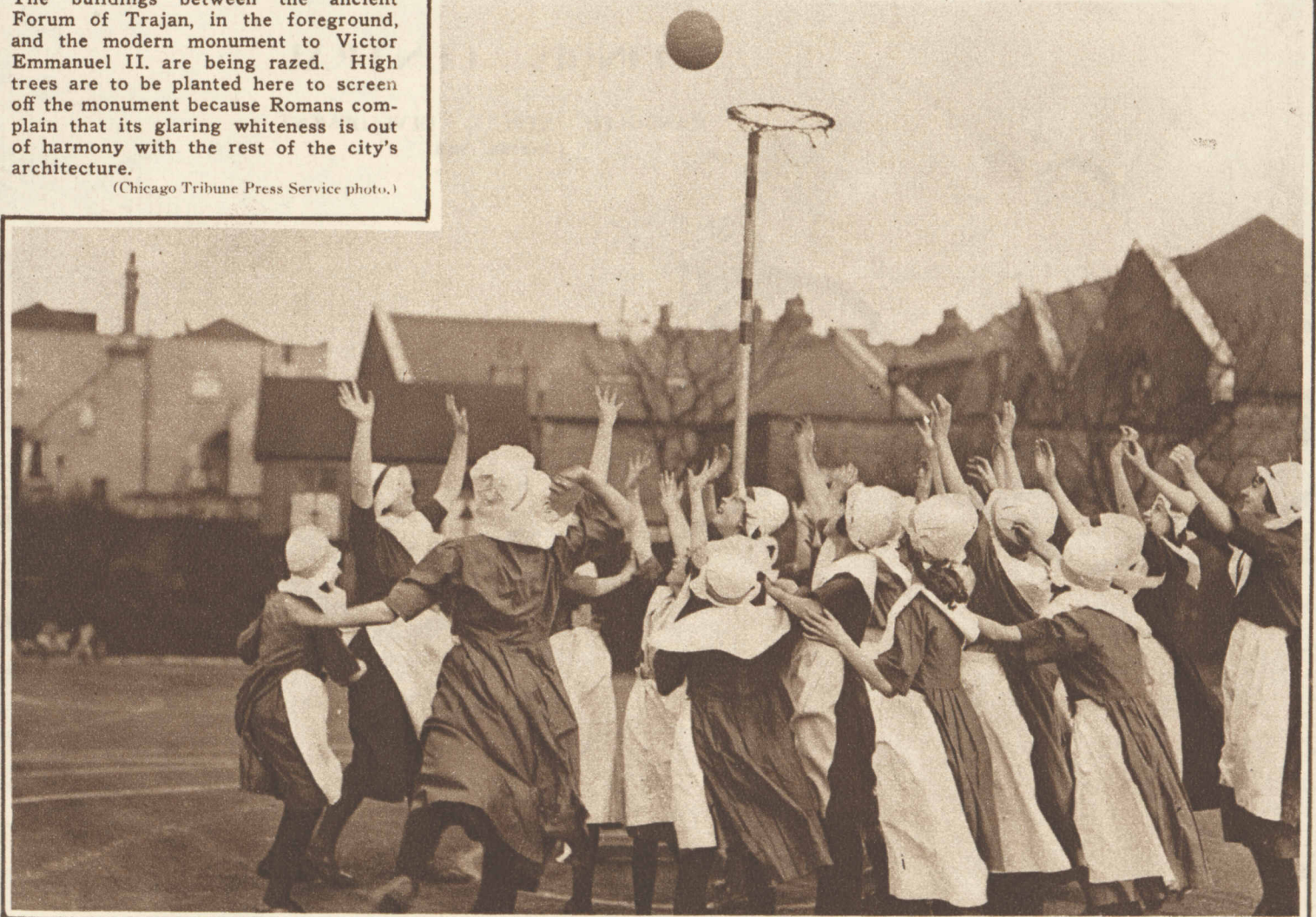
NETBALL IN EIGHTEENTH CENTURY DRESS —Pupils at Archbishop Tenison's school at Lambeth, London, wear costumes whose style was dictated at the time of the school's foundation in 1706, in spite of which handicap the young ladies are ardent sportswomen.